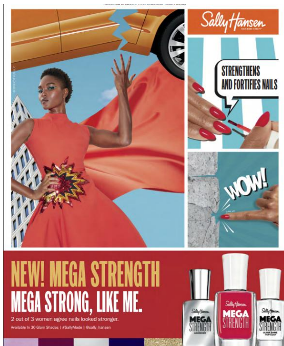
Figure 21: Sally Hansen. Elle , April 2019.

The MORE IS UP metaphor is predominantly present in the advertisement. There is an example of this in the sentence 'Mega shine, mega pout, all day'. Mega is the main word for describing the lip gloss in this advertisement and it occurs in other sentences. Just like max and super, which can be found in previous advertisements, mega creates a similar effect on the consumer. It also supports the GOOD IS UP metaphor, because mega is portrayed as up. The gloss is described as having the 'highest level of shine for a mega glossy look'.