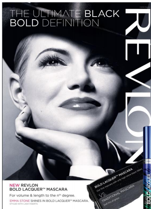
Figure 15: Revlon. Vogue , July 2014.

The MORE IS UP metaphor is represented in several instances of the advertisement. Firstly, there is in the description of the product: 'Lashes so lifted, so dramatic. Dare to get the push-up effect'. The orientational metaphor is conveyed through the words such as lifted, dramatic and push-up. Push-up is an adjective referred to lifting something up, commonly used in words like push-up bra or push-up jeans. However, the name push up mascara evokes an emotional effect on the consumer more than if it was called firming mascara for example. One of the metaphorical concepts that evoke this emotional effect can be seen in the following part: 'Drama? Sometimes I like to push it.' and this entails the EMOTIONAL EFFECT IS PHYSICAL CONTACT metaphor. The main effect that this advertisement aims to achieve is the push-up effect of the mascara and this is hereby achieved on both the visual and emotional level.