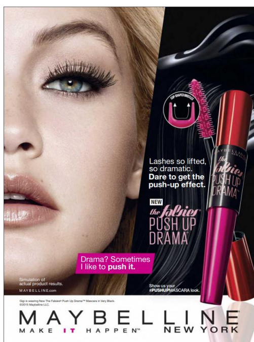
Figure 14: Maybelline. Elle , December 2018.

In this section, orientational metaphors in make-up products will be analyzed. The makeup advertisements that were chosen are mostly mascara advertisements and the last two advertisements are lip gloss and nail polish advertisements. The advertisements are from the following brands: Maybelline, Revlon, Rimmel, L'Oréal and Sally Hansen.