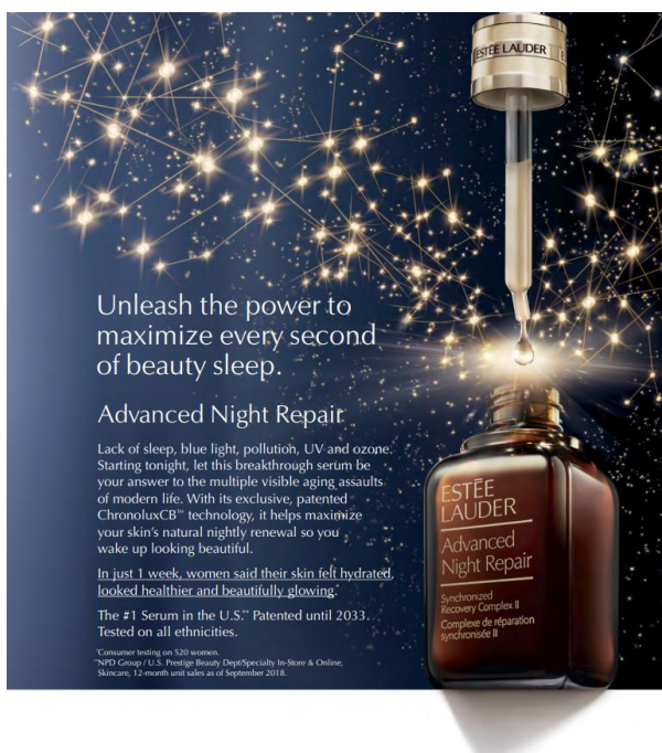
Figure 3: Estée Lauder. Vogue , March, 2019.

natural, healthy look to the skin is seen as better.