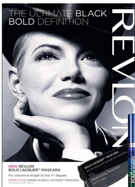
Figure 15: Revlon. Vogue , July 2014.

The MORE IS UP metaphor is represented in several instances of the advertisement. Firstly, there is in the description of the product: 'Lashes so lifted, so dramatic. Dare to get the push-up effect'. The orientational metaphor is conveyed through the words such as lifted, dramatic and push-up. Push-up is an adjective referred to lifting something up, commonly used in words like push-up bra or push-up jeans. However, the name push up mascara evokes an emotional effect on the consumer more than if it was called firming mascara for example. One of the metaphorical concepts that evoke this emotional effect can be seen in the following part: 'Drama? Sometimes I like to push it.' and this entails the EMOTIONAL EFFECT IS PHYSICAL CONTACT metaphor. The main effect that this advertisement aims to achieve is the push-up effect of the mascara and this is hereby achieved on both the visual and emotional level.