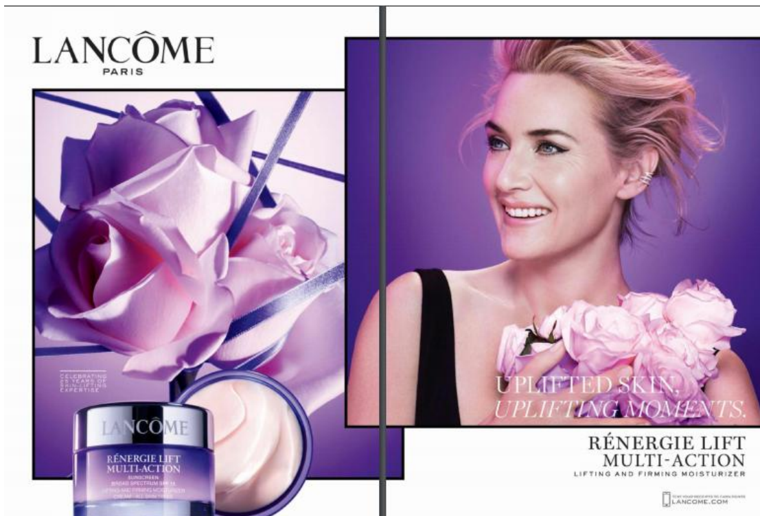
Figure 6: Lâncome. Vogue , June 2017.

This example uses a similar advertising technique as the previous one. In this advertisement the product is an anti-aging moisturizer from the brand Lâncome. Lancôme, similar to Estée Lauder is a high-end brand that offers a variety of products. Just like the Olay+Covergirl anti-aging foundation, it is also advertised by a celebrity. This particular anti-aging skin care product also has a distinct advertising manner as do other previously mentioned products.