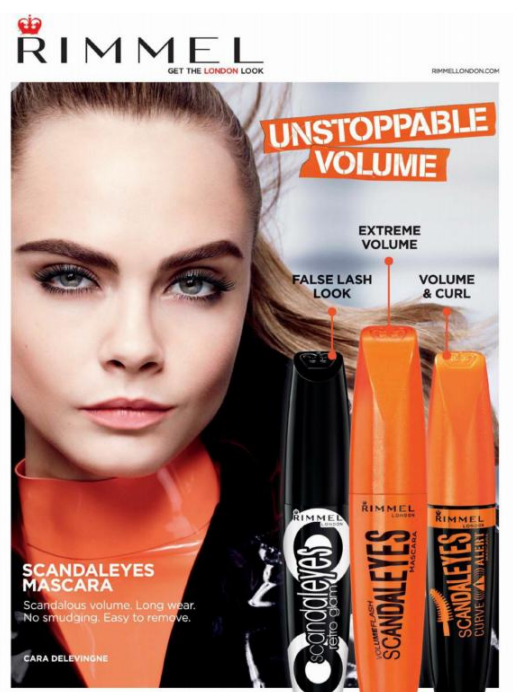
Figure 16: Rimmel. Vogue , May 2017.

In this advertisement, the visual and verbal elements work together to carry the underlying message of the advertisement across in a simple, minimalistic way.