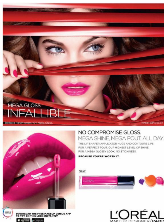
Figure 20: L'Oréal. Elle , July 2015.

Overall, there are some patterns that can be found in all the analysed mascara advertisements, such as the verbal message being connected with the visual message. In terms of the visual elements, the focal parts were either the eyes or the eyelashes. Next, in almost all the advertisements the products were represented by a famous person and in some, mostly newer ones, hashtags were used for the products. The prevalent metaphor in mascaras is MORE IS UP, the advertisements focusing mostly on the length, volume and texture being up.