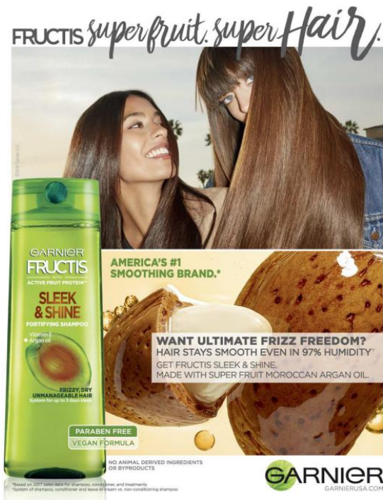
Figure 10: Garnier. Elle , December 2018.

This advertisement is also for Garnier, but this one is a hair shampoo and this line of products is called Garnier Fructis. It follows a similar advertising path as the previous one. However, this product seems to be directed towards a younger target audience, judging by the two models in the advertisement. Again, the focus is taken away from their faces and put on their hair.