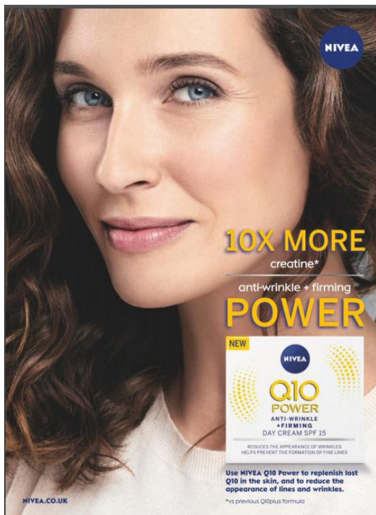
Figure 7: Nivea. Marie Claire , January 2019.

When comparing the previous advertisement and this one, there is a similar effect used in advertising the product. In the previous advertisement, the foundation is compared to a beautiful future and in the present example the moisturizer is compared to uplifting moments in life. Both of these advertisements promote promising events that will happen if the consumer uses this particular product.