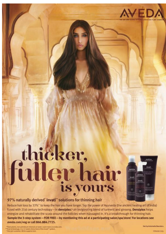
Figure 12: Aveda. Cosmopolitan , July 2014.

The orientational MORE IS UP metaphor is also present since there is a co-occurrence of the word luminise, meaning the more luminous your hair is, the more luminous your life will be, but also because hair shine is equated to a ‘48hr show-stopping shine’. Besides metaphor, there is also the presence of metonymy, particularly the OBJECT USED FOR USER metonymy in ‘Let’s luminise! Join the shine movement with #Luminise’. In other words, you can luminise and join the shine movement by using this line of products. There is also the presence of a hashtag and the part ‘Join the shine movement’ evokes the SOCIETY IS A PERSON metaphor.