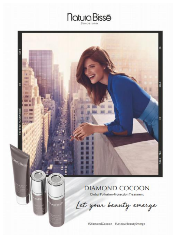
Figure 8: Natura Bissé. Marie Claire , January 2019.

This advertisement also shares some similarities with the last two advertisements. The target audience is immediately addressed through the person in the advertisement; it contains mainly visual elements and a short representation and description of the product. This is only the second example where the word anti-aging is overtly stated. The main idea behind the product is that it has ‘10x more creatine’ and that it has ‘anti-wrinkle and firming power’. The name of the product is also Q10 Power. The first metaphor that comes to mind and is portrayed with the concept of power is HAVING CONTROL OR FORCE IS UP . In other words, the underlying force of the cream adds to the replenishment of the skin and the reduction of wrinkles. The other metaphor that arises is MORE IS UP and it contains the underlying idea that TEN TIMES MORE IS UP or that ten times more is better.