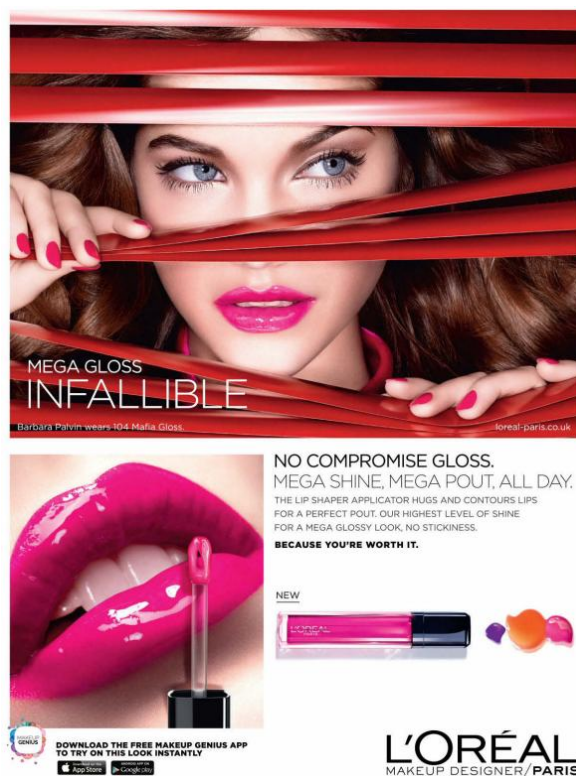
Figure 20: L'Oréal. Elle , July 2015.

Overall, there are some patterns that can be found in all the analysed mascara advertisements, such as the verbal message being connected with the visual message. In terms of the visual elements, the focal parts were either the eyes or the eyelashes. Next, in almost all the advertisements the products were represented by a famous person and in some, mostly newer ones, hashtags were used for the products. The prevalent metaphor in mascaras is MORE IS UP, the advertisements focusing mostly on the length, volume and texture being up.