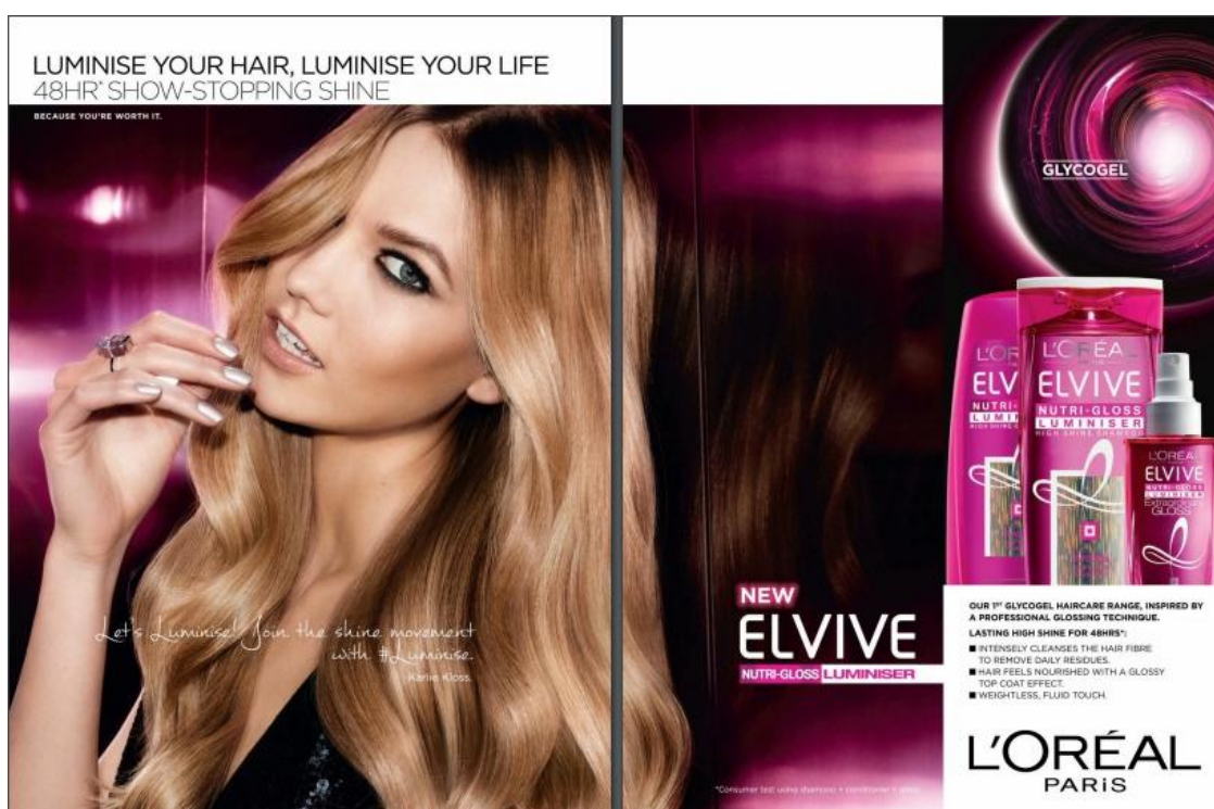
Figure 11: L'Oréal. Elle , July 2015.

brown. Both of these colors are evocative of nature in order to accentuate the natural origin of the products. In the Aveeno advertisement the kiwi is shown as being squeezed into the product. In Garnier advertisements there are pictures of avocados, olives and shea and argan nuts that go together with the notion of nourished, shiny and smooth hair. Interestingly enough, the product names in Aveeno and Garnier advertisements also accentuate what the advertisers want to bring forth in a product. For example, ‘Nutrisse’ or ‘Fructis’ both seem like they are of French origin, but these words do not have a meaning in French. However, they are similar enough to the English language, so that they evoke words like nourish and fruit. Aveeno, on the other hand, is a scientific name for oat, the basic ingredient in all of their products.