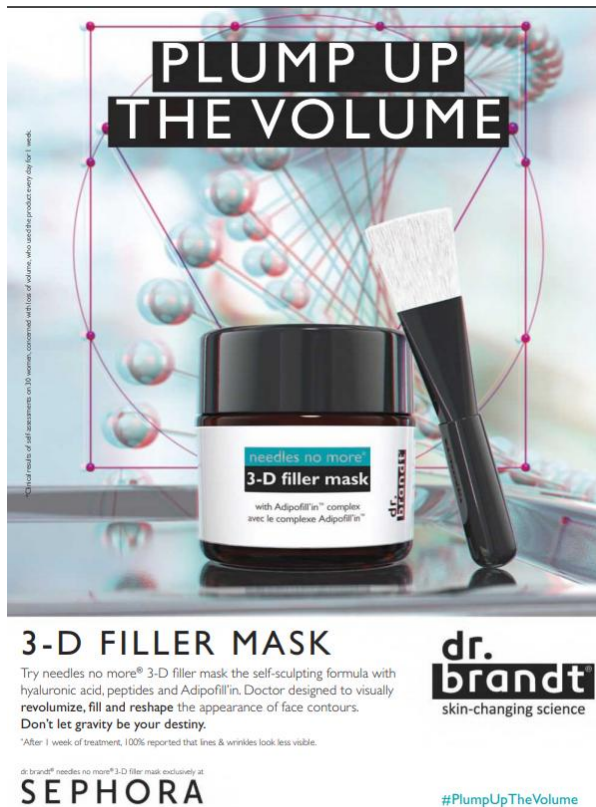
Figure 4: Dr. Brandt. Elle , January 2016.

emerges from the maximizing of sleep, whereby more beauty sleep equals more power of the serum. Another metaphor that can be found here is ACTIVITY IS A SUBSTANCE , beauty sleep being the activity and the night serum being the substance.