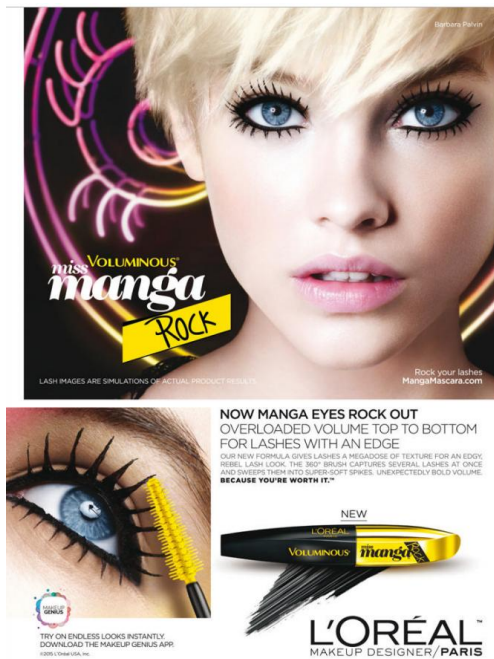
Figure 19: L'Oréal. Vogue , June 2015.

MORE IS UP metaphor. The mascara is said to have an 'instant lash-lift effect' and 'intense length'. And the slogan that says 'Lift it. Stretch it. No limit.' also contains this account for the metaphor. In this particular advertisement the mascara does not only reach to paradise, its reaching power is presented as unlimited and this advertisement particularly shows the underlying MORE IS UP metaphor.