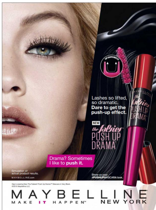
Figure 14: Maybelline. Elle , December 2018.

In this section, orientational metaphors in make-up products will be analyzed. The makeup advertisements that were chosen are mostly mascara advertisements and the last two advertisements are lip gloss and nail polish advertisements. The advertisements are from the following brands: Maybelline, Revlon, Rimmel, L'Oréal and Sally Hansen.