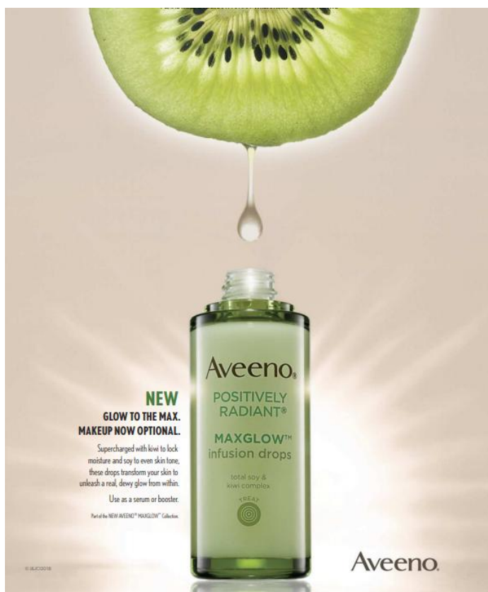
Figure 1: Aveeno. Elle , December 2018.

magazine advertisement is showed and then it is described.