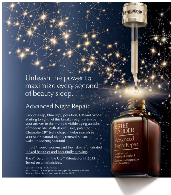
Figure 3: Estée Lauder. Vogue , March, 2019.

natural, healthy look to the skin is seen as better.