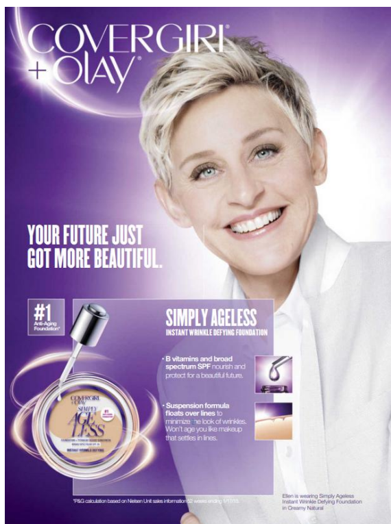
Figure 5: Covergirl+Olay. Elle , February 2016.

At the top of the advertisement it says ‘Plump up the volume’. There is also interplay with the word plump, which means full or rounded and the phrasal verb pump up, which means to increase something and in this particular case there is a reference to the volume. Altogether, this slogan forms the underlying MORE IS UP metaphor or, more specifically MORE VOLUME IS UP. In the bottom corner there is a hashtag for the slogan, written in the following way: #PlumpUpTheVolume. The emergence of hashtags in advertisements is a newer form of brand advertising in order to get closer to the consumer, especially to the modern consumer. Apart from the hashtag ‘Pump up the volume’ is the name of a popular song, which can also be seen as a play on words. All of the above goes hand in hand with the portrayal of the brand as modern.