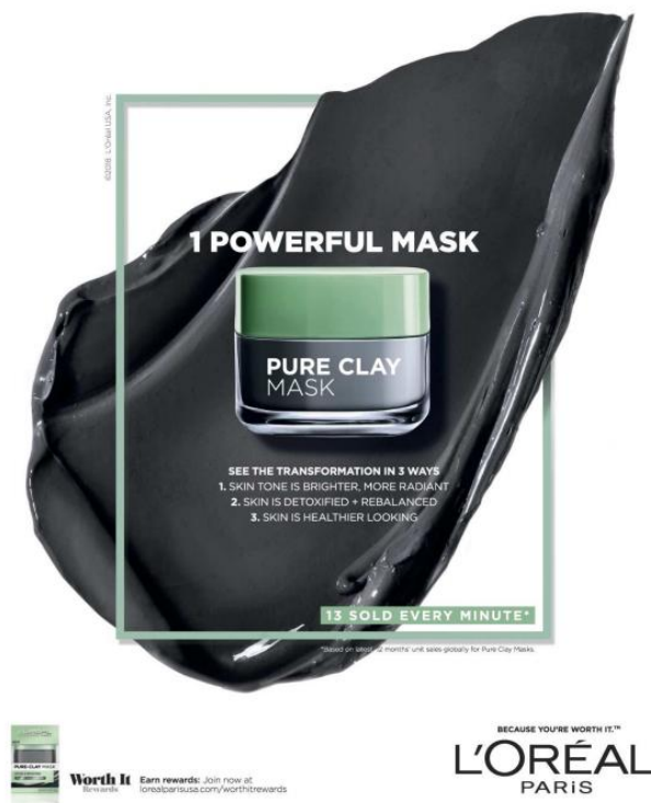
Figure 2: L'Oréal. Elle , December 2018.

Then there is the name of the product itself, ‘Maxglow’ infusion drops. Firstly, it is important to mention that this is actually a serum or a booster, but this can only be read from the description of the product towards the bottom of the picture. With this product, one is supposed to ‘Glow to the max’. This notion of maximum represents something that is the highest or the greatest, i.e. if we take this example, this entails glowing to the highest or greatest level there is. This leads to the focal MORE IS UP metaphor and the metaphor is also culturally coherent as the notion of more is better complies with the MORE IS UP metaphor.