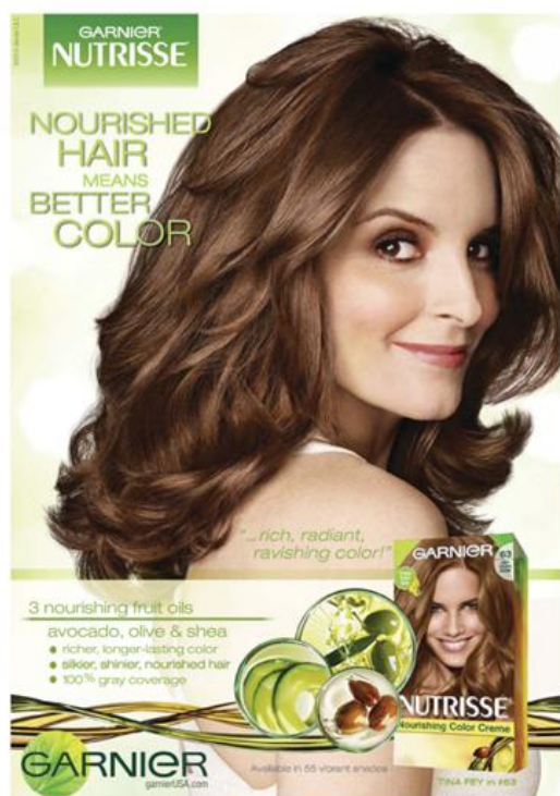
Figure 9: Garnier. Cosmopolitan , December, 2014.

In this section, orientational metaphors in hair care products advertisements will be analyzed. The advertisements are from the following brands: Garnier, L'Oréal and Aveda. The products mentioned are hair shampoo, hair dye, hairspray or a line of products for hair.