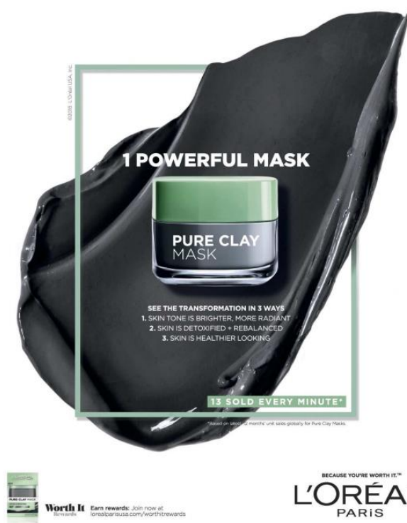
Figure 2: L'Oréal. Elle , December 2018.

Then there is the name of the product itself, ‘Maxglow’ infusion drops. Firstly, it is important to mention that this is actually a serum or a booster, but this can only be read from the description of the product towards the bottom of the picture. With this product, one is supposed to ‘Glow to the max’. This notion of maximum represents something that is the highest or the greatest, i.e. if we take this example, this entails glowing to the highest or greatest level there is. This leads to the focal MORE IS UP metaphor and the metaphor is also culturally coherent as the notion of more is better complies with the MORE IS UP metaphor.