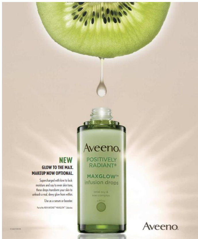
Figure 1: Aveeno. Elle , December 2018.

magazine advertisement is showed and then it is described.