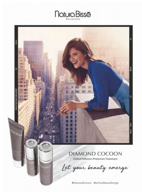
Figure 8: Natura Bissé. Marie Claire , January 2019.

This advertisement also shares some similarities with the last two advertisements. The target audience is immediately addressed through the person in the advertisement; it contains mainly visual elements and a short representation and description of the product. This is only the second example where the word anti-aging is overtly stated. The main idea behind the product is that it has ‘10x more creatine’ and that it has ‘anti-wrinkle and firming power’. The name of the product is also Q10 Power. The first metaphor that comes to mind and is portrayed with the concept of power is HAVING CONTROL OR FORCE IS UP . In other words, the underlying force of the cream adds to the replenishment of the skin and the reduction of wrinkles. The other metaphor that arises is MORE IS UP and it contains the underlying idea that TEN TIMES MORE IS UP or that ten times more is better.