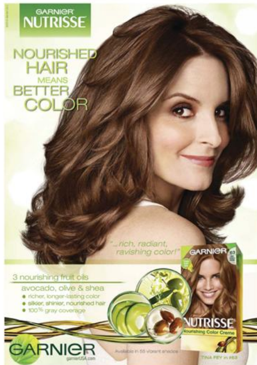
Figure 9: Garnier. Cosmopolitan , December, 2014.

In this section, orientational metaphors in hair care products advertisements will be analyzed. The advertisements are from the following brands: Garnier, L'Oréal and Aveda. The products mentioned are hair shampoo, hair dye, hairspray or a line of products for hair.