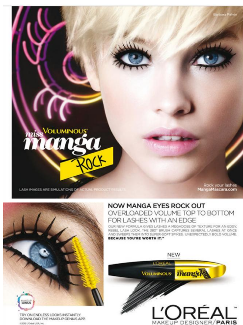
Figure 19: L'Oréal. Vogue , June 2015.

MORE IS UP metaphor. The mascara is said to have an 'instant lash-lift effect' and 'intense length'. And the slogan that says 'Lift it. Stretch it. No limit.' also contains this account for the metaphor. In this particular advertisement the mascara does not only reach to paradise, its reaching power is presented as unlimited and this advertisement particularly shows the underlying MORE IS UP metaphor.