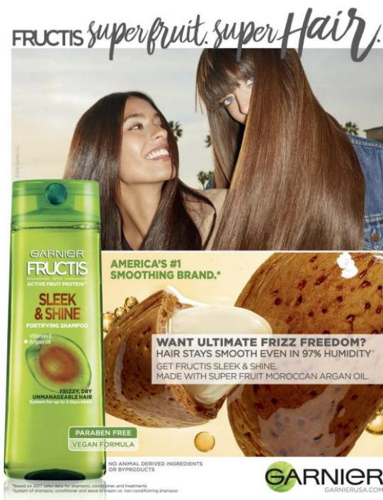
Figure 10: Garnier. Elle , December 2018.

This advertisement is also for Garnier, but this one is a hair shampoo and this line of products is called Garnier Fructis. It follows a similar advertising path as the previous one. However, this product seems to be directed towards a younger target audience, judging by the two models in the advertisement. Again, the focus is taken away from their faces and put on their hair.