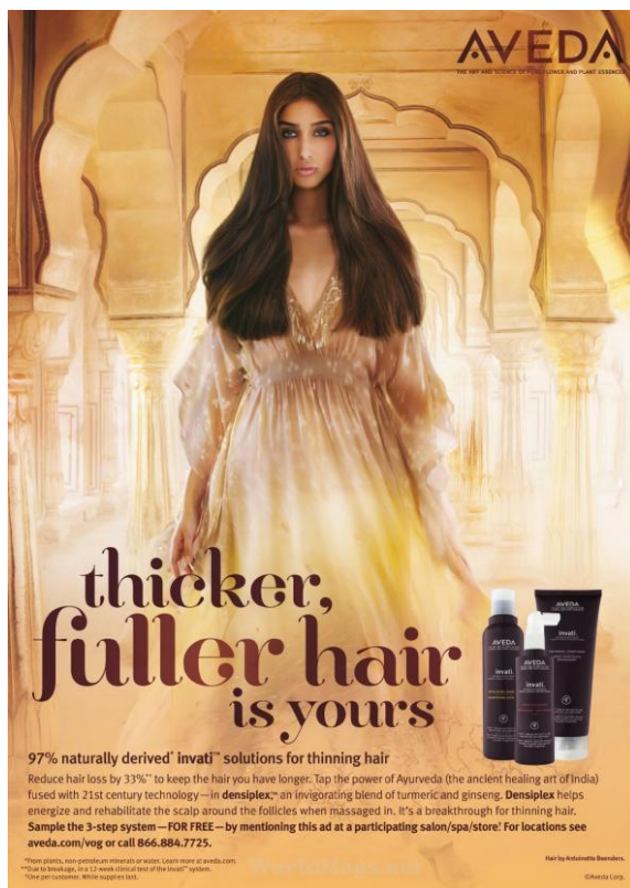
Figure 12: Aveda. Cosmopolitan , July 2014.

The orientational MORE IS UP metaphor is also present since there is a co-occurrence of the word luminise, meaning the more luminous your hair is, the more luminous your life will be, but also because hair shine is equated to a '48hr show-stopping shine'. Besides metaphor, there is also the presence of metonymy, particularly the OBJECT USED FOR USER metonymy in 'Let's luminise! Join the shine movement with #Luminise'. In other words, you can luminise and join the shine movement by using this line of products. There is also the presence of a hashtag and the part 'Join the shine movement' evokes the SOCIETY IS A PERSON metaphor.