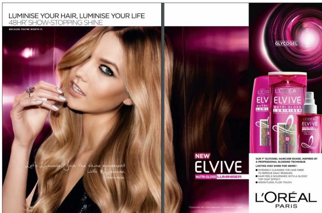
Figure 11: L'Oréal. Elle , July 2015.

brown. Both of these colors are evocative of nature in order to accentuate the natural origin of the products. In the Aveeno advertisement the kiwi is shown as being squeezed into the product. In Garnier advertisements there are pictures of avocados, olives and shea and argan nuts that go together with the notion of nourished, shiny and smooth hair. Interestingly enough, the product names in Aveeno and Garnier advertisements also accentuate what the advertisers want to bring forth in a product. For example, ‘Nutrisse’ or ‘Fructis’ both seem like they are of French origin, but these words do not have a meaning in French. However, they are similar enough to the English language, so that they evoke words like nourish and fruit. Aveeno, on the other hand, is a scientific name for oat, the basic ingredient in all of their products.