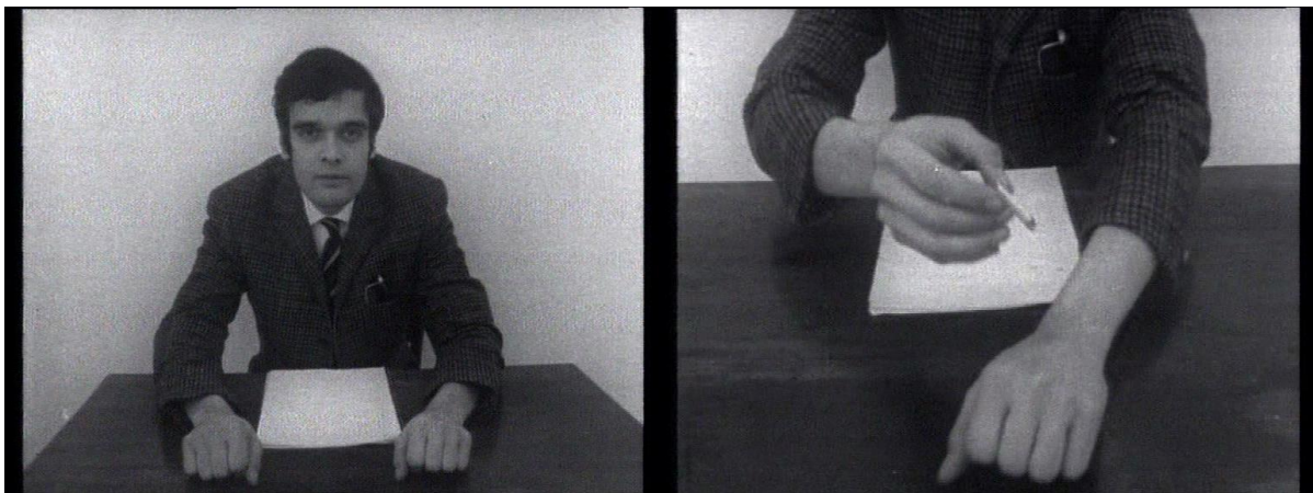
Figure 2. The Inextinguishable Fire ( Nicht löschesbares Feuer , Farocki, 1969).

Treating film language as capable of showing (and therefore producing) the spectators on the one side and narrative agents on the other is one of his most important additions in film art and theory. In his first notable film from 1969 The Inextinguishable Fire ( Nicht löschesbares Feuer ), the author himself is shown to the spectator, sitting behind the table and reading the film script out loud. In technocratic language, he is reading the chemical report on the effects on napalm.