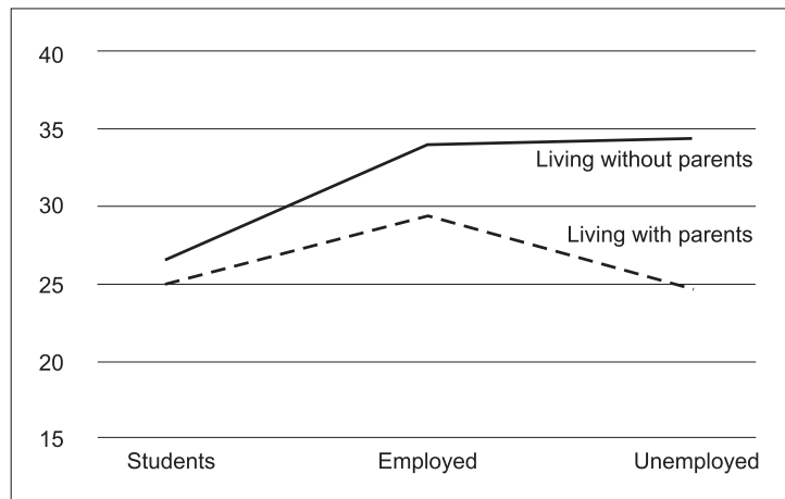
FIGURE 1 Interaction effect between professional status and living arrangements on achieved adulthood criteria

The only significant interaction effect was between professional status and living arrangements (Figure 1). Post-hoc analysis (Scheffe test) showed that there is no significant difference in the achieved criteria of adulthood among students ( p = 0.468 ), while employed ( p < 0.01 ) and unemployed ( p < 0.001 ) young adults who live independently achieved more criteria of adulthood comparing to the ones who live with their parents. Additionally, employed young adults who live with their parents achieved more adulthood criteria than unemployed ones also living with parents ( p < 0.0001 ).