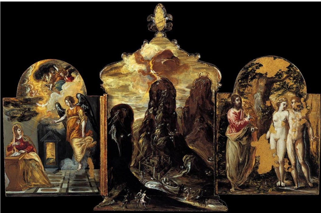
El Greco, Modena Triptych , showing the Annunciation (left), View of Mount Sinai (center), and Expulsion from Paradise (right), c. 1567 Galleria Estense, Modena, Italy

Each of the three triptychs originally constituted two lateral wings attached to a central panel into which the sides could be folded 50 , with the relative thinness of both wooden boards which comprise the Heraklion work implying that each was at one