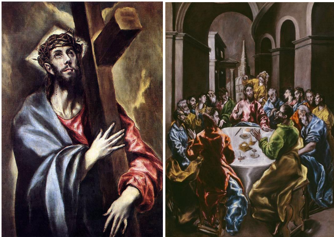
El Greco, Christ Bearing the Cross , 1600-05, Museo del Prado, Madrid, Spain (left)

deep-tones colors, and an eerie, almost magical light that can be seen in many works by the Venetian master. Another version of the subject, painted perhaps five or six years earlier, 122 however, reveals a precedent from Byzantine iconography, where representations of the Last Supper are often grouped around a circular or semi-circular table, a form which goes back to a sixth-century Byzantine manuscript, the Codex Rossanensis. In this work is once again present his unique perpetuation of Eastern forms in emphasizing the spiritual and emotional side of Western religious art. Frederick A. Sweet notes that such Byzantine influence had last been felt in 15 th -century Sieneese painting, which was then submerged in the humanizing effects of the Italian Renaissance. 123