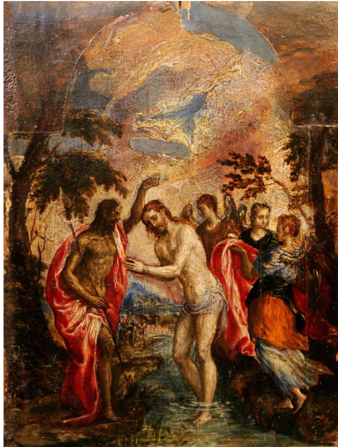
El Greco, Baptism of Christ , c. 1567-70 Historical Museum of Crete, Heraklion, Greece

The Baptism of Christ panel was attributed on account of its resemblance to a nearly identical work which appears on the inside of the Modena Triptych , which includes the only other surviving example of this motive from the initial decade of his career. The dimensions of the two panels are nearly identical, with both having originally been cut with the same rounded tops and with nearly identical dimensions. Both works also rely on a print by Giovanni Battista d'Angeli (del Moro) which displays, albeit, in reverse, John the Baptist standing on the bank of the Jordan with Christ facing him, ankle-deep in running water, with clasped hands and his head bent forward. Although compositional similarities between these two works indicate they were created around the same time, there also exist certain compositional and technical oddities which make it difficult to determine which is the earlier work. Certain scholars insist that the more refined figurative execution and fluid qualities of the Heraklion version stand as evidence for a later date of creation than that of the Modena work, with its more rigid composition. There also exist striking differences in color palette – while the Modena Baptism is dominated by yellows and greens, the