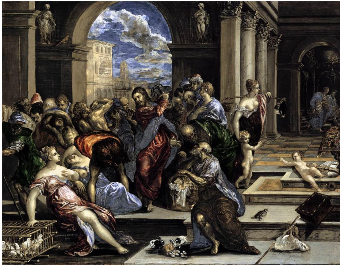
El Greco, Christ Cleansing the Temple , before 1570 Samuel H. Kress Collection