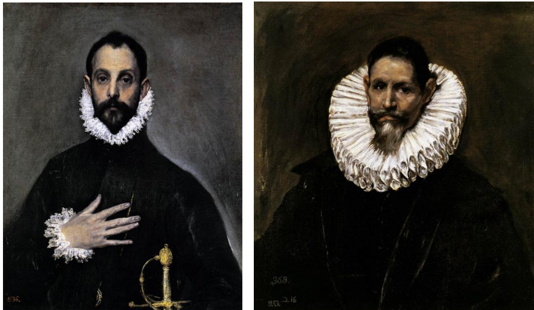
El Greco, Man with His Hand on His Breast , 1583-85, Museo del Prado, Madrid, Spain (left) El Greco, Jerónimo de Cevallos , c. 1610, Museo del Prado, Madrid, Spain (right)

swaying in the wind is a compositional element that can be seen in many works by mid-sixteenth-century Venetian artists, and it speaks of the influence he directly picked up in Venice before his arrival in Rome. This, along with the portrait's brushwork and its treatment of color express El Greco's personal ambition to fashion himself a Venetian-trained painter. The Farnese collection in Rome contained large numbers of paintings by Titian and other Venetian masters, 118 and the artist could have used this portrait as a means of aligning himself with the talents he had studied during his sojourn in Venice. 119