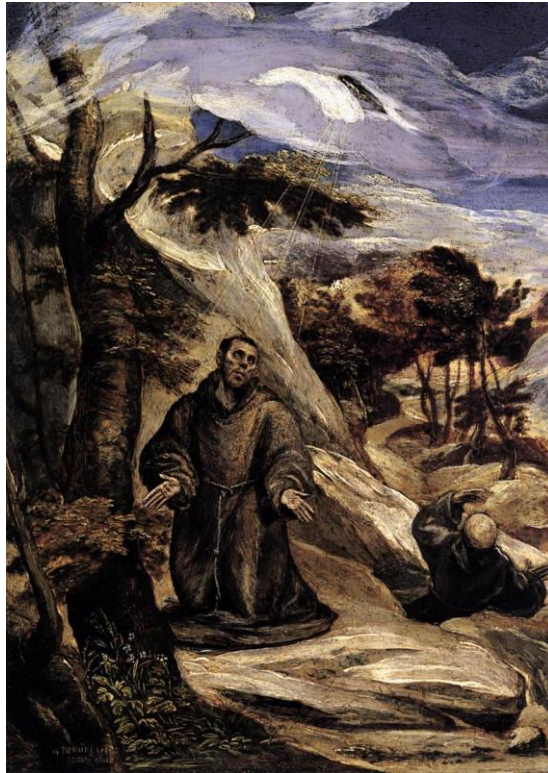
El Greco, St Francis Receiving the Stigmata , c. 1570 Istituto Suor Orsola Benincasa, Naples, Italy