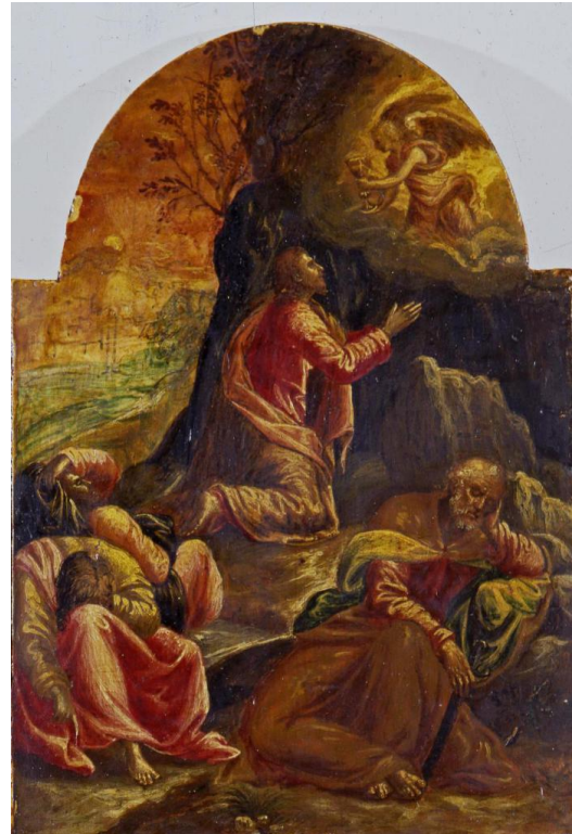
El Greco, Washing of the Feet (left), Agony in the Garden (right), Christ Before Pilate (below left), Crucifixion (below right), all from Ferrara Triptych , c. 1567-68 Pinacoteca Nazionale di Ferrara, Ferrara, Italy