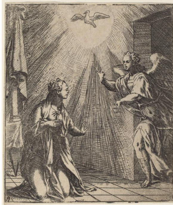
Giovanni Battista Fontana, Annunciation , first half of 16 th century National Gallery of Art, Washington, DC, US

The third multi-panel altarpiece attributed to El Greco's Venetian period is a work commonly referred to as the Ferrara Triptych , which consists of four separate panels that once comprised the lateral wings of a larger ensemble. The paintings, presently at the Pinacoteca Nazionale in Ferrara, differ in their themes from the other examples of El Greco's early portable triptychs. While the Modena Triptych combines scenes from both Old and New Testament events, the Ferrara Triptych only displays episodes from Christ's Passion – Washing of the Feet , Agony in the Garden , Christ Before Pilate , and the Crucifixion . 56 Just as is the case with his aforementioned multi-panel works, the individual paintings have been divided. With regard to iconographic sources, many prints have come to light which reveal the wealth of print sources the artist drew from. The Washing of the Feet finds certain elements in Albrecht Dürer's thematically corresponding Small Passion series, while Agony in the Garden also borrows from prints of the same theme by Dürer, Benedetto Montagna, and Lucas van Leyden. The artist's dependence at this stage is further demonstrated in Christ Before Pilate , as elements are once again borrowed from Dürer's Small and Large Passion as well as various engravings by Enea Vico. Uniquely, the scene of the Crucifixion derives from a single print by Giovanni Battista d'Angeli, 57 the composition one of