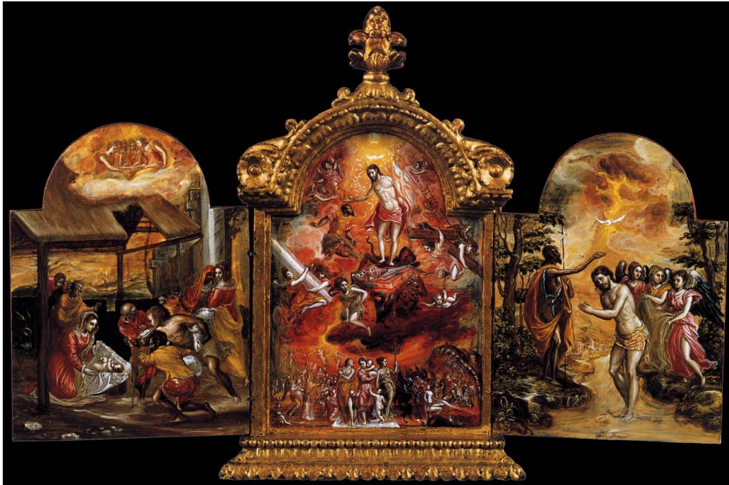
El Greco, Modena Triptych , showing Adoration of the Shepherds (left), Christ Crowning the Christian Soldier (center), and Baptism of Christ (right), c. 1567 Galleria Estense, Modena, Italy