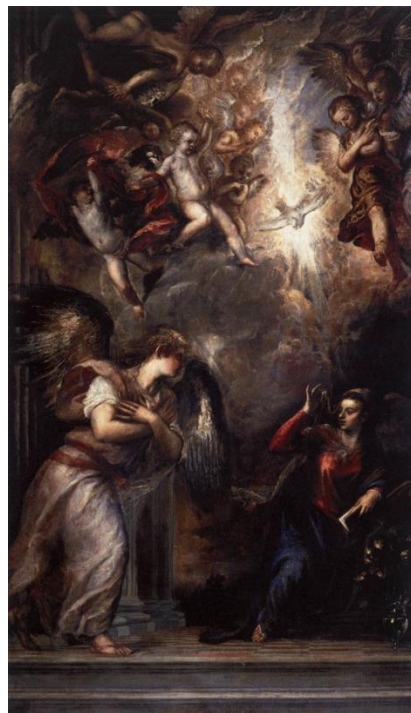
Titian, Annunciation , 1562-64 San Salvador, Venice, Italy