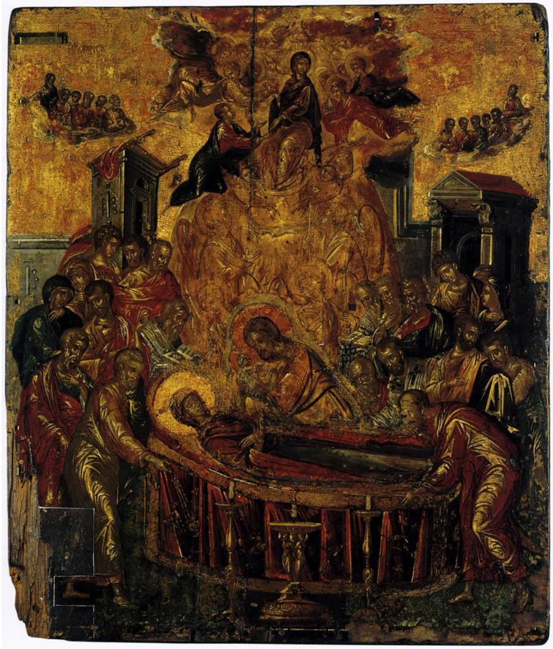
El Greco, Dormition of the Virgin , c. 1565 Holy Cathedral of the Dormition of the Virgin, Ermoupoli, Greece