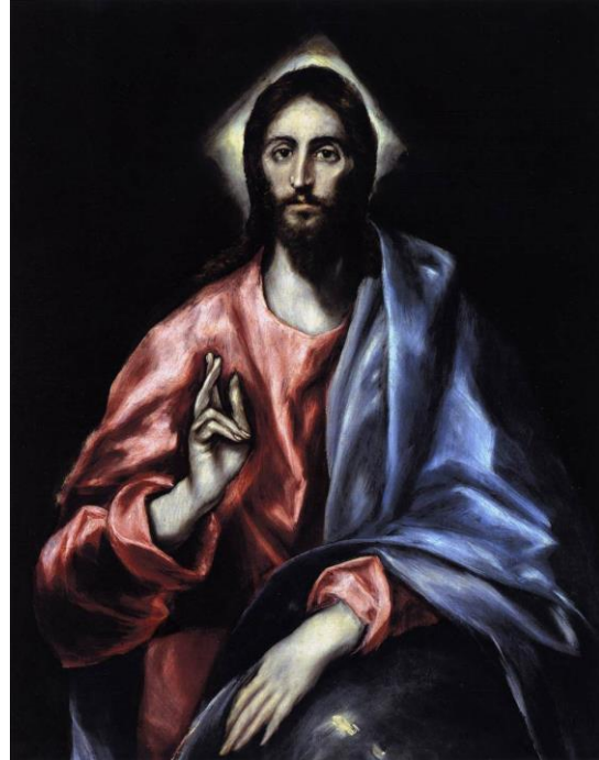
El Greco, St Dominic in Prayer , 1586-90, Private collection (left) El Greco, Christ as Savior , 1610-14, Museo de El Greco, Toledo, Spain (right)

The Venetian treatment of color more blatantly present in earlier works and later subdued to the advantage of a Roman, Spanish, and distinctly individual style nonetheless reappeared in many later paintings. Perhaps the most telling are examples of portraiture. His melodious, quiet, and purposive portrait of a Spanish nobleman from the late 1570s, entitled Man with His Hand on His Breast , is characterized by a dramatic technique that marked works by Tintoretto, Titian, and other Venetian masters – the illuminated hands and face of the subject are thrown into relief against a very dark background. The subtle contrasts of dark and light, of the showy and the discreet, and the realistic and the abstract are all undeniably Venetian stylistic markers as well. 116 El Greco's role of passionate and responsive interpreter of the 16 th -century Venetian liberation of color and light is blatant in another portrait, that of Jeronimo de Cevallos from the first quarter of the 17 th century. The work has been called the richest and revealing of all of Greco's late portraits . 117 Another earlier of his works and one of the relatively small number of portraits attributed to the artist during his Italian period, the Portrait of Giulio Clovio from c. 1572 clearly once again betrays the influence of Titian. The open window looking onto a turbulent landscape of trees