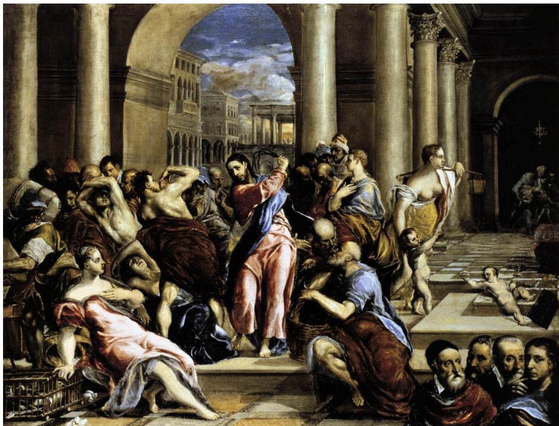
El Greco, Cleansing of the Temple and detail (below), c. 1570 Minneapolis Institute of Arts, Minneapolis, US

much that Ellis Waterhouse dubbed him an eclectic borrower . 91 In his Cleansing of the Temple , he transparently pays homage to four Italian artists whose work directly influenced his own. In the lower right-hand corner of his second version of the painting, El Greco somewhat tellingly inserted first Titian, then Michelangelo, Giulio Clovio, and finally an unascertained portrait of what is presumed to be Raphael. 92 The figures, of whom three are the triumvirate of the most celebrated artists in 16 th -century Italy, are spatially and thematically removed from the narrative, and they function as almost a meta-pictorial footnote which credits the plurality of influence which contributed to his artistic development in Italy. The painting itself appropriately exhibits a summa of his study of those same artists – most notably the plasticity of Michelangelo and the color and brushwork of Venetian artists, namely Titian. 93