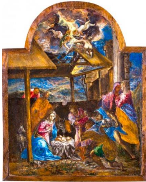
El Greco, Adoration of the Shepherds , c. 1567 Agnes Etherington Art Centre, Queen's University Kingston, Ontario, Canada

scene to the whole of the Modena Triptych has not yet been adequately identified, the scene must have been a common one to include in contemporary multi-panel works. 53