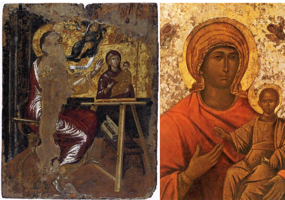
El Greco, St Luke Painting the Virgin and Child , before 1567, Benaki Museum, Athens, Greece (left) The Virgin Mesopanditissa , 12 th or 13 th century, Santa Maria della Salute, Venice, Italy (right)

The heavily-damaged St Luke Painting the Virgin and Child is one of El Greco's earliest surviving Cretan icons, and the only extant example of this most commonly depicted subject of Cretan icon painters. 21 Dubbed without exception, one of the finest of the era , the image's flawless execution testifies to the artist's skill in Byzantine-style icon painting. Compositionally, it differs little from other contemporary versions, but there are traces of his employing two rather distinct artistic styles, Western and Eastern, within the same work. Although the small icon of the Hodegitria is based entirely on late-Byzantine pictorial conventions which were common to Cretan iconographers, aspects of the work are enlivened with Western stylistic and iconographic elements. Most obviously, they are evident in the somewhat more modeled figure of St Luke, the naturalism of the angel which hovers above, and the agitated drapery of the figures. The treatment of pictorial space is also approached with a more refined illusionism than one usually sees in the works of Cretan painters. It can be said that this juxtaposition and coexistence of two differing forms within the same work foreshadows the heterogeneous fund of influences he would ultimately accept. 22