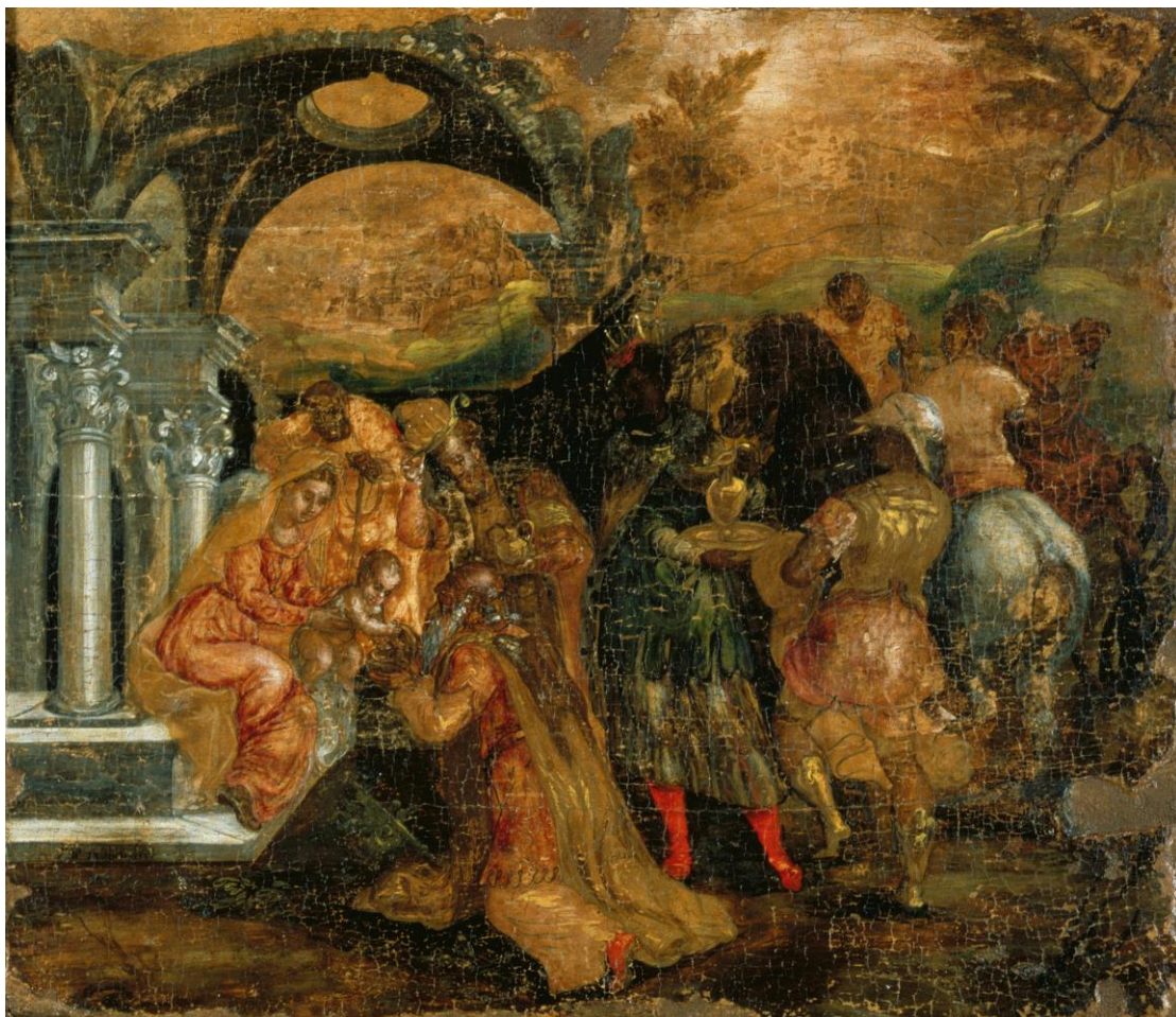
El Greco, Adoration of the Magi , before 1567 Benaki Museum, Athens, Greece

His departure from Byzantine forms and adoption of Venetian models can be seen even in his Cretan works; the Adoration of the Magi , for example, draws from identifiable works by Venetian artists. The icon, in addition to its looser application of paint, restrained use of gold, and more spacious background looks to the Venetian pictorial idiom in its composition. The Virgin's mannered pose, her legs crossed as she leans forward to present the Child to the adoring Magi, finds its source in an engraving by Marco d'Angeli after Venetian Renaissance painter Andrea Schiavone. The figure removing the soldier's crown may originate in an engraving by Giovanni Battista Franco, perhaps better known as Giovanni Battista Veneziano. 7 Despite these clearly attributed sources, the hybridity of the artist's work, especially of the early, formative period, has borne contradictory and often clashing interpretations, which often shun one or both influences originating in Crete and Venice.