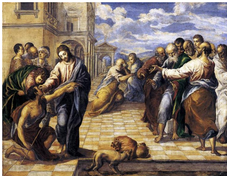
El Greco, Christ Healing the Blind , c. 1570 Gemäldegalerie Alte Meister, Staatliche Kunstsammlungen, Dresden, Germany

His development of religious narratives in the late 1560s and 1570s marks a novel entry in his artistic repertoire, and the compositional techniques of the works model elements of religious and liturgical theater, absorbed through artistic sources. The artist's concern for dramatization in these narratives is evident, from his inclusion of visual rhetoric of gestures to the integration of figures into a scenic background. Both subjects show implementation of a more daring setting than he had yet attempted, and the depictions conform to a category of history painting (or istoria ), that Leon Battista Alberti called 'a painter's most important undertaking'. As Alberti's narrative did not appear in the Italian vernacular until 1547, the text played an integral role in the development of the religious narrative much later than it was first written. Around mid-century, we see its influence on the development of ever increasingly theatrical narratives by Tintoretto and other Venetian contemporaries. Alberti's treaty still being relatively current upon El Greco's arrival in Venice in 1567 means it likely played a guiding role in the young painter's self-tutorial of Italian art. 78 He matched the standard of painterly drama set out by his Venetian, and later Roman, peers.