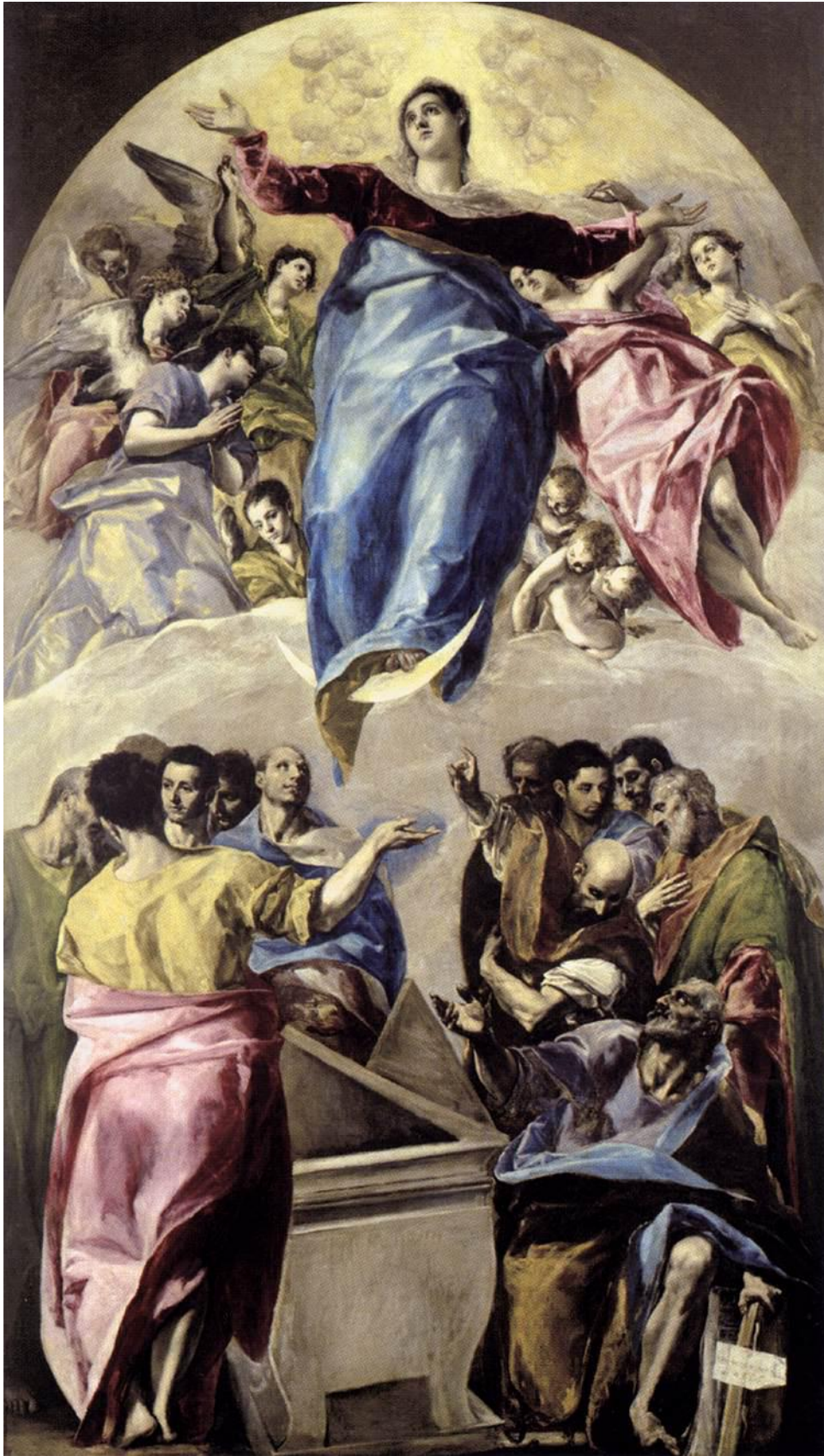
El Greco, Assumption of the Virgin , 1577 Art Institute, Chicago, US