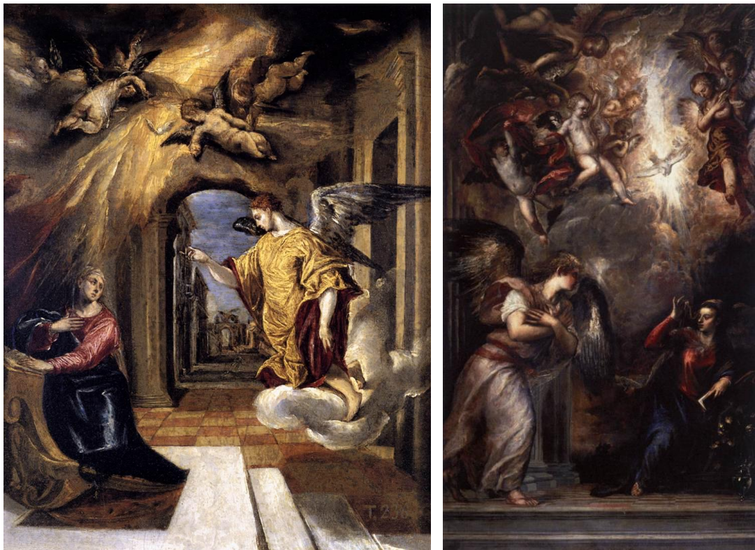
El Greco, Annunciation , c. 1570, Museo del Prado, Madrid, Spain (left) Titian, Annunciation , c. 1559-64, San Salvador, Venice, Italy (right)

of effect. The modulated textured use of yellow pigment which materializes a divine light, as well as the incandescent glow illuminating Mary's face in El Greco's Annunciations , put his appropriation of Venetian coloring practices on full display, as do the Flight into Egypt and the numerous versions of St Francis Receiving the Stigmata . 102 The works' loose, gestural strokes all document El Greco's efforts to denounce the maniera greca in favor of a more Venetian style in these small-scale devotional paintings. The artist dissolves the depicted materials so as to signal the spiritual intensity of the scene as well as his own creative facture, just as Titian did when he loosened his handling of pigment in his later works. In essence, it was the style of these works, and not their direct compositional structures, which was to guide El Greco's appropriation of the Venetian style. In it, he saw the means to render images in a way that emphasized the mystical properties of the events portrayed for the purpose of heightening devotional and emotional impact. 103