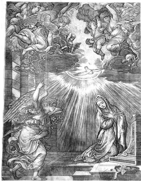
Gian Giacomo Caraglio (after Titian for Santa Maria degli Angeli, Murano), Annunciation with Angels , c. 1527-37 Scottish National Gallery, Edinburgh, Scotland