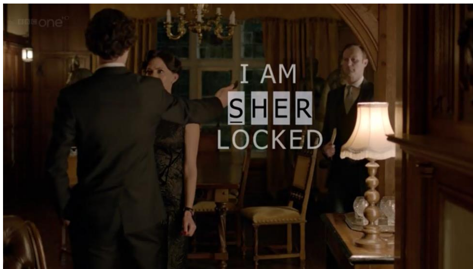
Fig. 6. Sherlock (Benedict Cumberbatch) cracks the phone's passcode. A Scandal in Belgravia . Writ. Gatiss, Moffat and Thompson. BBC. 2012. Television.

Furthermore, depicting a lesbian character truly falling in love with a man is a complete invalidation of her sexual identity. It advances the notion that lesbians are a myth, that all women can fall in love with men if given the right circumstances. Having a female opponent who is as cunning as Sherlock ultimately lose due to her emotions also implies that women are incapable of keeping their emotions in check. Sherlock insists that her “sentiment is a chemical defect found in the losing side.” and that “love is a dangerous disadvantage”. (ASIBe) While he can detach from his emotions, she cannot, and thus he will always be better than her at the game.