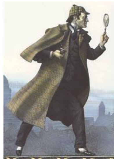
Fig.1. Sydney Paget illustration of Sherlock Holmes. Hat Guide . http://hatguide.co.uk/deerstalker/ .

Finally, the visual image of Sherlock Holmes is very important when conducting a character study. Even though Arthur Conan Doyle did not provide the readers with a detailed description of the character's appearance, there is an image of Sherlock Holmes that has stayed with the audience to this day. It was Sydney Paget that illustrated the publications in "The Strand Magazine." Through the illustration, Paget gave Holmes some of the trademarks that he is known for even today, such as deerstalker hat, magnifying glass and a pipe (see fig. 1) However, he did not have these things with him on every illustration.