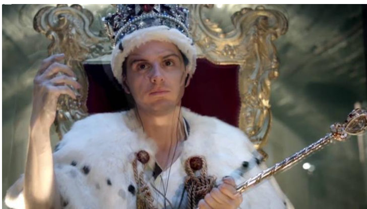
Fig. 7. Jim Moriarty (Andrew Scott). The Reichenbach Fall . Writ. Gatiss, Moffat and Thompson. BBC. 2012. Television.

In The Final Problem , Sherlock’s death is not so vivid, not at all that articulately planned; in fact, most of it is left to speculation and imagination. Watson recalls: “And then what had happened? Who was to tell us what had happened then?” (Doyle, TFP 412) It is, however, considered that the two men engaged in a physical fight and then both fell of the cliffs