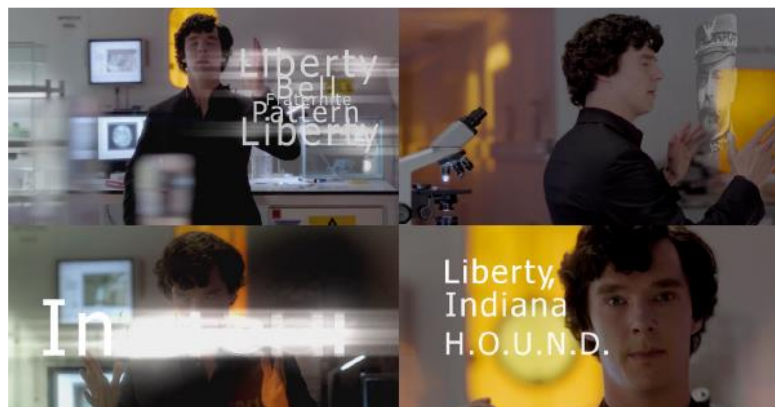
Fig 3. Sherlock Holmes (Benedict Cumberbatch) is rearranging his deductions. The Hounds of Baskervilles . Writ. Gatiss, Moffat and Thompson. BBC. 2012. Television.

Although the relevance of his web searches and the likes do not seem relevant, it actually provides a window into the brain of the famous detective, and one of the first adaptations to do so. The viewers get to be a part of the deduction process which happens