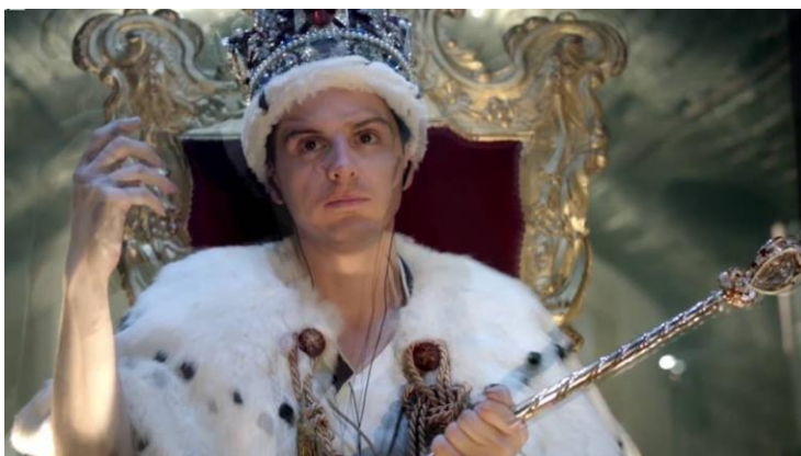
Fig. 7. Jim Moriarty (Andrew Scott). The Reichenbach Fall . Writ. Gatiss, Moffat and Thompson. BBC. 2012. Television.

In The Final Problem , Sherlock’s death is not so vivid, not at all that articulately planned; in fact, most of it is left to speculation and imagination. Watson recalls: “And then what had happened? Who was to tell us what had happened then?” (Doyle, TFP 412) It is, however, considered that the two men engaged in a physical fight and then both fell of the cliffs