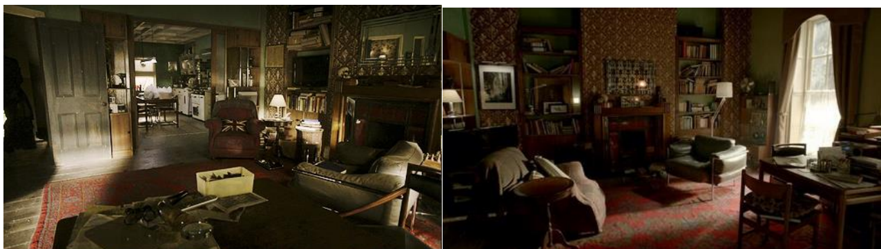
Fig 4. The set of 221B Baker Street flat in BBC studio. Sherlockology on Set: A Visit to 221B . Sherlockology, www.sherlockology.com/news/2014/1/17/sherlockology-on-set-a-visit-to-221b-170114 .

The set of the flat on 221B Baker Street is dedicated to details – “tiny pictures arranged along the hallway walls, a collection of well-worn boots on the landing outside the flat, a single car that is permanently parked outside on the gigantic photo-stitch of Baker Street/ North Gower Street, and a generally vast amount of clutter.” (Sherlockology) The production designer Arwel Wyn Jones says that it contributes to the sense that it is a real place. A modern design of the flat would not do; a retro renovation of the place was needed to bring the atmosphere that was present when Doyle imagined the flat in which Sherlock’s and John’s everyday life intertwined with their adventures. (see fig. 4)