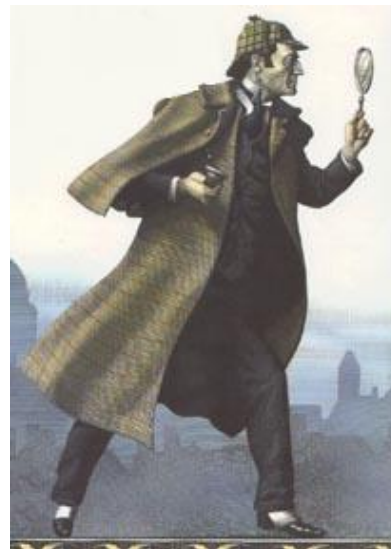
Fig.1. Sydney Paget illustration of Sherlock Holmes. Hat Guide . http://hatguide.co.uk/deerstalker/ .

Finally, the visual image of Sherlock Holmes is very important when conducting a character study. Even though Arthur Conan Doyle did not provide the readers with a detailed description of the character's appearance, there is an image of Sherlock Holmes that has stayed with the audience to this day. It was Sydney Paget that illustrated the publications in "The Strand Magazine." Through the illustration, Paget gave Holmes some of the trademarks that he is known for even today, such as deerstalker hat, magnifying glass and a pipe (see fig. 1) However, he did not have these things with him on every illustration.