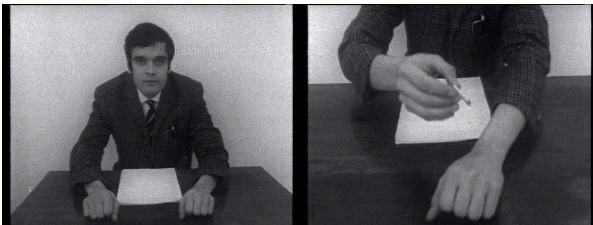
Figure 2. The Inextinguishable Fire ( Nicht löschesbares Feuer , Farocki, 1969).

Treating film language as capable of showing (and therefore producing) the spectators on the one side and narrative agents on the other is one of his most important additions in film art and theory. In his first notable film from 1969 The Inextinguishable Fire ( Nicht löschesbares Feuer ), the author himself is shown to the spectator, sitting behind the table and reading the film script out loud. In technocratic language, he is reading the chemical report on the effects on napalm.