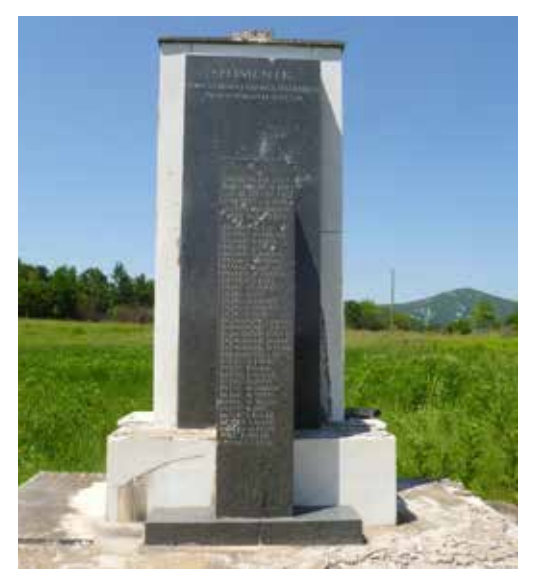
Figure 2. Damaged monument in Barlet, near Gospić

* An example of a typical local monument dedicated to fallen Partisans and civilian victims. The inscriptions read "We must protect the brotherhood and unity for which the fighters from this heroic village gave their lives" and "We must never forget the fallen fighters and what they did for the new socialist Yugoslavia."