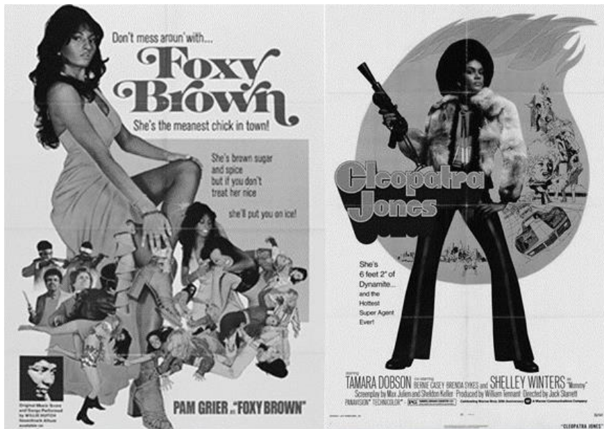
Figure 5 Foxy Brown and Cleopatra Jones movie posters

Another common portrayal of African Americans in films can be seen in the role of the magical Negro. This role portrays male and female African Americans as faithful and kind helpers to the white protagonist. Entman and Rojecki (2001) said there are three main purposes of the magical Negro: to assist the main character, to help them explore and employ their spirituality, and to use their wisdom to solve the dilemma of the white character. The magical Negro, as an African American woman, also takes on the stereotypical portrayals of the Jezebel and the Mammy. When it comes to the controlling images of the Jezebel in this role, she assumes her sexualized persona by either using her sexual knowledge to assist the protagonist and better his knowledge of sex or by being a sexual fantasy of a character in the film (Francois, 2013).