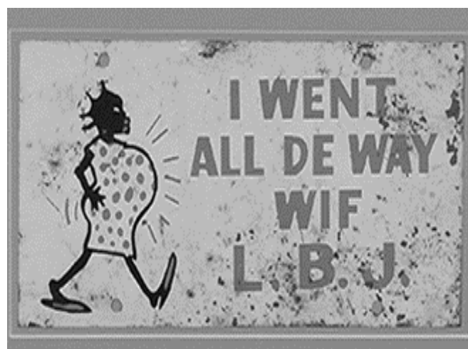
Figure 4 Lyndon B. Johnson licence plate