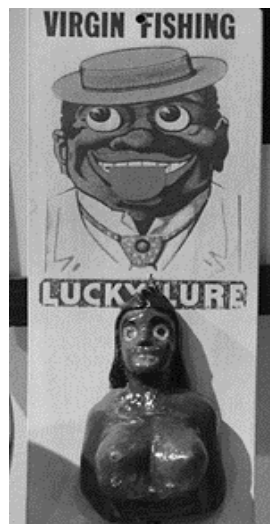
Figure 3 Lucky Lure

Lucky lure was another example of items depicting African American women as sexual beings. It was a topless bust with a fishing hook. Many postcards were also used to degrade African American women. Some of them even used children, showing them as sexual objects. The pictures showed teenage girls, or sometimes even younger, with their normal faces but with exposed adult sized buttocks, naked or hiding behind towels, trees or other objects. Black women are often portrayed as pregnant or with many children surrounding them, put on postcards or, in the case of president Lyndon B. Johnson, on license plates.