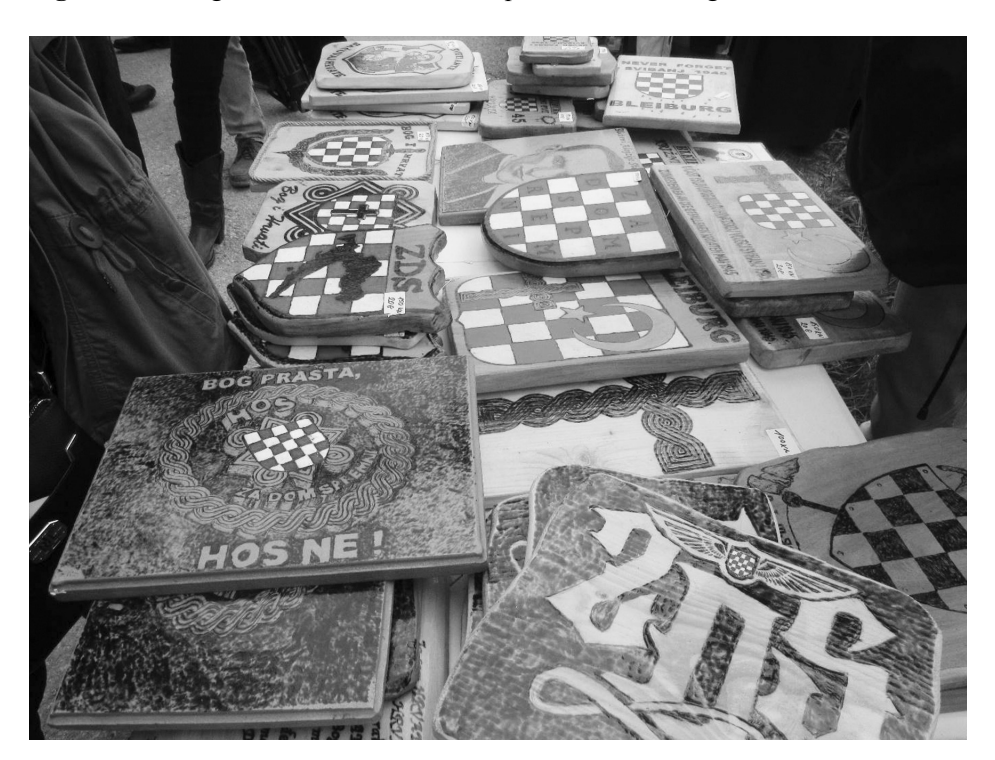
Figure 5. Selling souvenirs with Za dom spremni at Bleiburg, 2017

indicating that they consider it a symbol that had been used by allies of the Nazi regime. Future research about the decision to use a certain version of the šahovnica could reveal whether people simply see it as a legitimate Croatian symbol or if they choose the white field first because of its ideological connotation. But there is little doubt that it is associated with right-wing political parties and is present at most commemorations dealing with communist crimes.