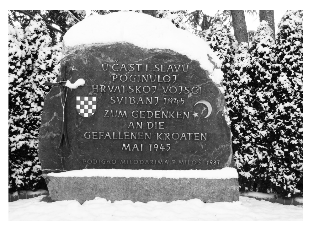
Figure 2. Memorial on Bleiburg Field

the victims, so the text read "In Memory of the Croatian Victims of the Bleiburg Tragedy". After all of these debates about the inscription, the original text from 1987 was returned to the monument with the reference to the Croatian Army. Like the memorial in Unter-Loibach, this monument features the Croatian coat of arms, a cross, and the Islamic crescent moon and star.