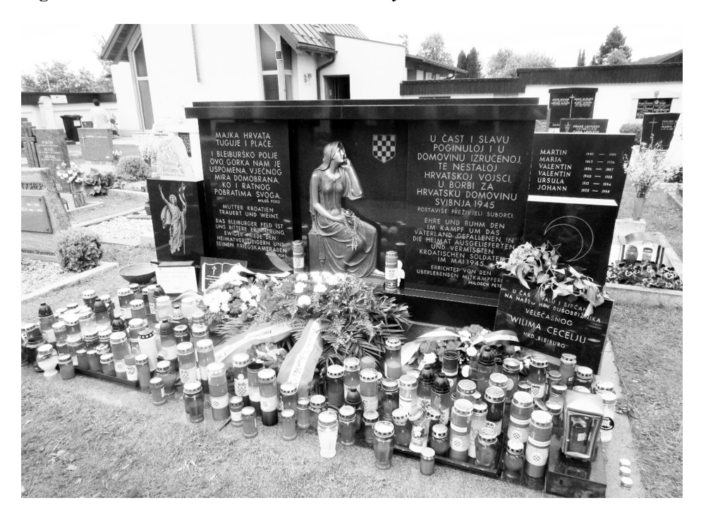
Figure 1. Memorial in Unter-Loibach cemetery

The PBV erected the main monument on Bleiburg Field in 1987, with the inscription "In Honor and Glory of the Fallen Croatian Army, May 1945" in Croatian and German. As in the case of the Unter-Loibach monument, the Austrian authorities did not accept the inscription referring to the "killed Croatian army". It is also interesting that the German version of the inscription is different than the Croatian one. In the German version the word "army" was omitted, leaving only "In Memory of the Fallen Croats, May 1945" ( Zum Gedenken an die gefallenen Kroaten, Mai 1945 ), which was another compromise so that the monument could appear. In 2004, the inscription was changed to "In Memory of the Innocent Victims of the Bleiburg Tragedy, May 1945". This change of the original inscription provoked conflicts inside the PBV, in which one group was asking for the return of the original inscription.<sup>26</sup> This inscription was changed once again to include the national identity of