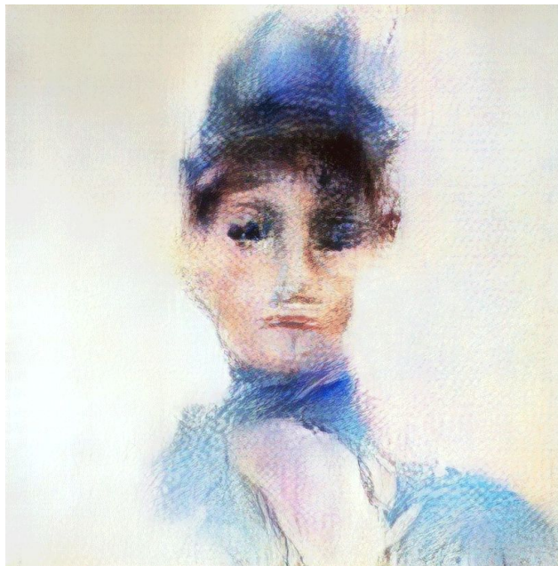
Figure 5: Obvious, Madam de Belamy , 2018

Let us take a look at another member of the Belamy family to see how this process plays out.