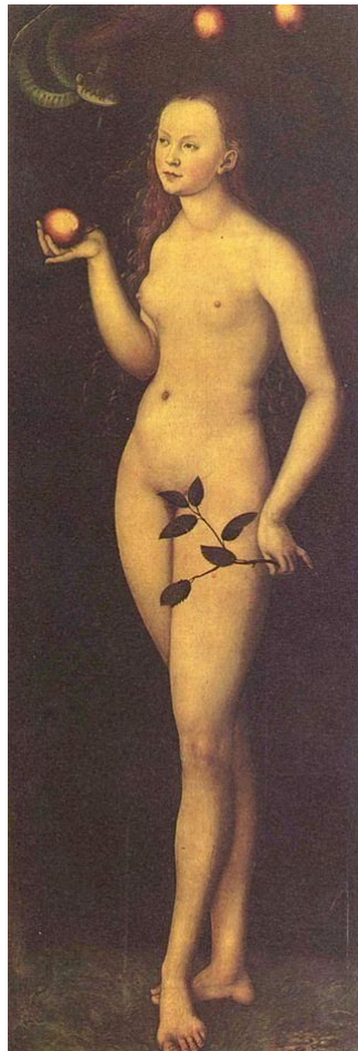
Figure 2: Lucas Cranach the Elder, Eva 1528

comprehensive naturalistic account of why people across cultures share metaphors. For instance, the choice to use snakes as a proxy for danger in art is not random. Indeed, before our distant ancestors had descended from the trees into the tall grasses, it was critical to watch out for snakes slithering on branches. It is no surprise, then, that snakes epitomize dangers in human narratives, such as in the Biblical story of Adam and Eve, in which a talking serpent was employed to symbolize peril.