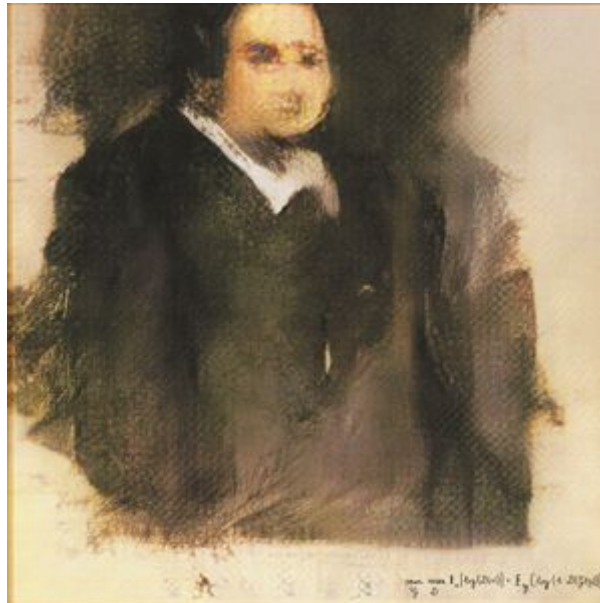
Figure 4: Obvious, Edmond de Belamy, 2018

themselves “Obvious”. They borrowed Barrat’s code to bring Edmond de Belamy into existence.