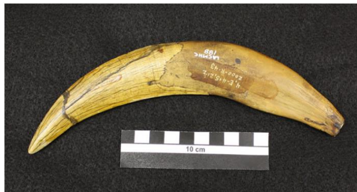
Figure 1: Canine tooth of a saber-toothed tiger ( Smilodon fatalis ).

It is to be expected that teeth are a necessary factor in the survival of every carnivore. However, this is not entirely true, as we find very effective carnivores without teeth, with very small or extremely highly developed teeth. In this paper, species that