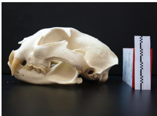
Slika 2: Zubalo risa ( Lynx lynx ). Vidljivo je skraćenje lubanje, naglašeni očnjaci i derači te sekodontno zubalo.

ih gornji četvrti pretkutnjak i donji prvi kutnjak. Pritom valja naglasiti kako su derači zapravo pravo obilježje kopnenih grabežljivaca (Savage, 1976.), dok morski grabežljivci imaju zubalo u znatnoj regresiji prema homodontnom i nemaju derače. Nešto manje je to izraženo u perajara, a znatno više u kitova zubana. Jedna od zanimljivosti derača je njihov način zatvaranja u vidu "dvostruke giljotine" (Savage, 1976.). Time se u početnom dijelu zatvaranja čeljusti derači dotiču u stražnjem dijelu, a tek kad su usta zatvorena i u prednjem dijelu. Ovakav model omogućuje stvaranje velike sile ugriza na maloj površini (Savage, 1976.). Prema Christiansenu i Adolfssenu (2005.) jačina ugriza mjerena na deračima najveća je u lava ( Panthera leo ) 3405 N, zatim tigra ( Panthera tigris ) 3007 N i polarnog medvjeda ( Ursus maritimus ) 2403 N. Za razliku od derača, očnjaci služe za probadanje i usmrćivanje, a u kombinaciji s prednjim ekstremitetima i za pridržavanje plijena. U pravilu su u kopnenih mesojeda očnjaci gornje i donje čeljusti podjednako razvijeni. Neke su vrste razvile posebno velike i masivne očnjake, primjerice medvjedi i velike mačke.