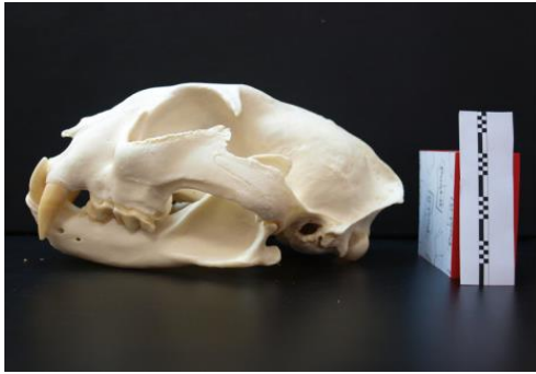
Figure 2: Dentition of a lynx ( Lynx lynx ). Shortening of the skull, accentuated canines and carnassial teeth, and a secodont dentition are apparent from this figure.