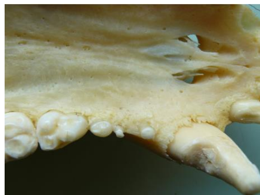
Slika 3: Zubalo smeđeg medvjeda ( Ursus arctos ). Obratite pozornost na znatno smanjena prva tri pretkutnjaka.

Ovdje svakako treba spomenuti pripadnike izumrlih vrsta sabljozubih mačaka (danas analize pokazuju da su bile srodnije lavovima negoli tigrovima), ali i drugih sabljozubih vrsta koje su imale i do 18 cm duge očnjake (slika 1) (Feranec, 2008.). Način na koji životinja pretežno dolazi do hrane moguće je također promatrati i prema snazi ugriza, tako primjerice lav ima ugriz na području očnjaka od 2152 N, a na deračima spomenutih 3407 N, dok primjerice pjegava hijena ( Crocota crocuta ) ima ugriz od 782 N na očnjacima i 1428 N na deračima. U ovoj podjeli, naime, lava smatramo izrazitim mesojedom, dok je pjegava hijena dobrim