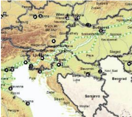
Picture 2: Detailed road and railway corridor Rijeka-Zagreb-Budapest