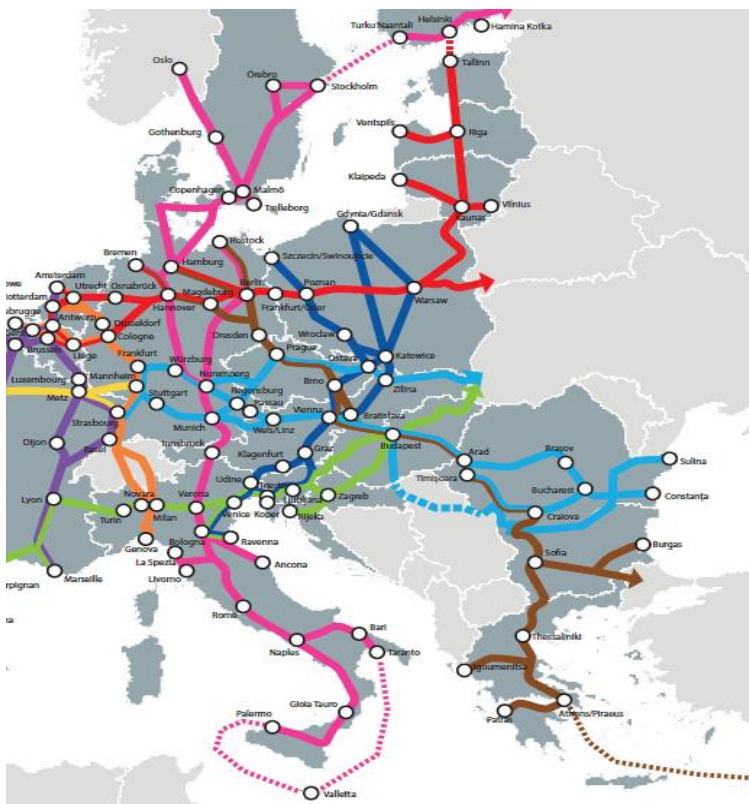
Picture 1: Fundamental trans-European network corridors (TEN-T corridors)

Source: http://www.tentdays2013.eu/Doc/b1_2013_brochure_lowres.pdf (04.02.2014)