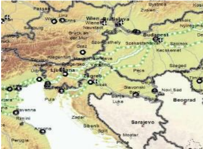
Slika 2: Detaljni cestovni i željeznički koridor Rijeka – Zagreb – Budimpešta