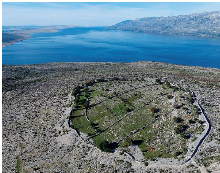
Sl. 4. Lergova gradina kod Slivnice Gornje