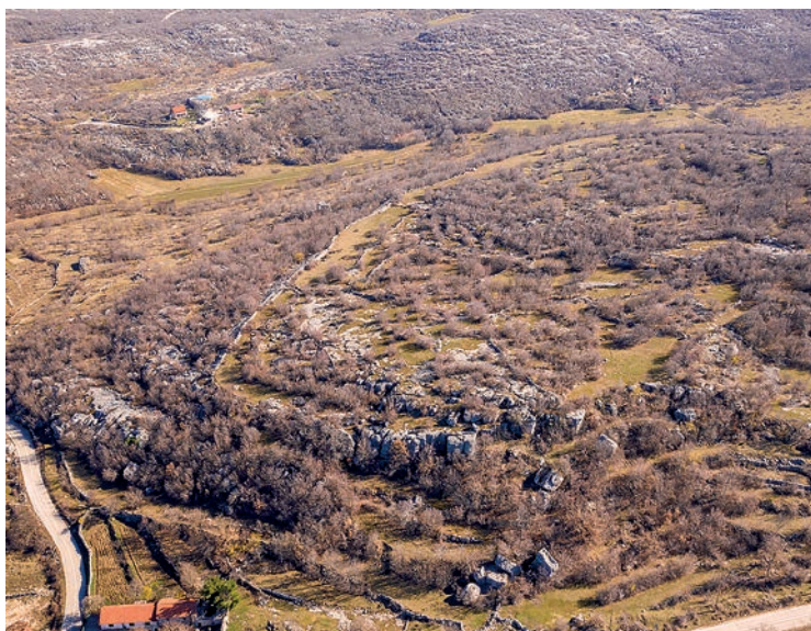
Sl. 3. Gradina u Medviđi