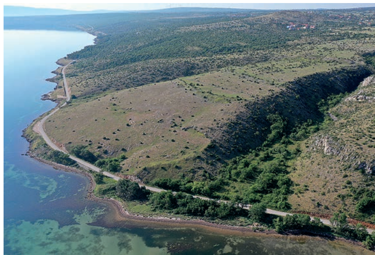
Sl. 1. Budim kod Posedarja