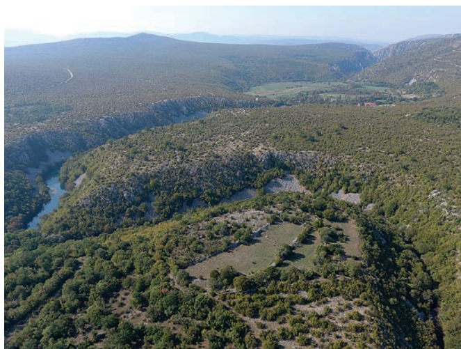
Sl. 2. Smokovac na sutoku Orovače i Krupe