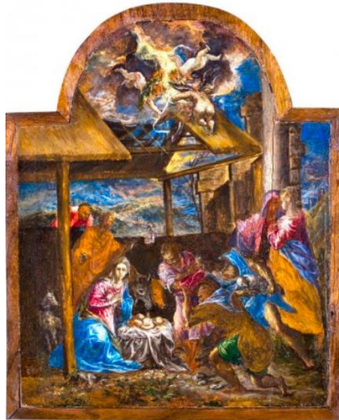
El Greco, Adoration of the Shepherds , c. 1567 Agnes Etherington Art Centre, Queen's University Kingston, Ontario, Canada

scene to the whole of the Modena Triptych has not yet been adequately identified, the scene must have been a common one to include in contemporary multi-panel works. 53