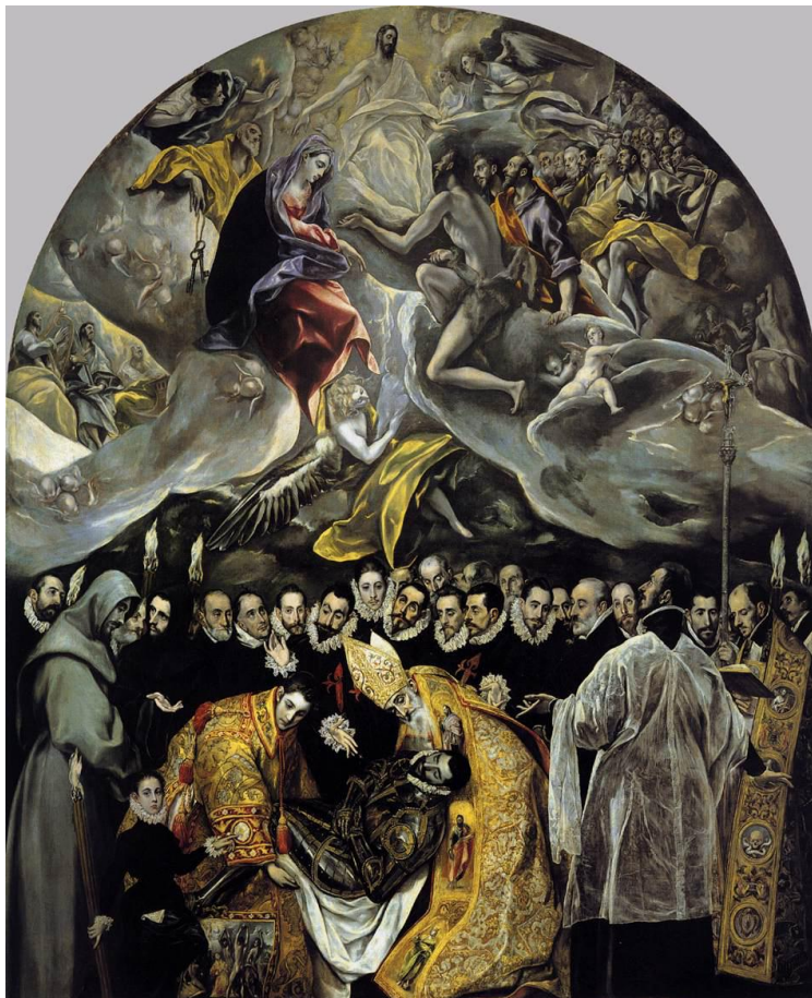
El Greco, Burial of the Count of Orgaz , 1586-88 San Tomé, Toledo, Spain

is also distinctly Byzantine. 113 The Eastern character of The Savior , painted in Spain between 1604 and 1614, is said to be unmistakable , and Leo Bronstein remarks that it is puzzling to find such typical, conventional, and external traits of Byzantine art in a work so late and within a period of El Greco's activity so emancipated – the facial type, the hieratic gesture, rigid frontality, intense fixity of the eyes all attest to an essentially retrospective stylistic source. Perhaps the painting was commissioned by one of his numerous refugee compatriots in Spain, but the pictorial idiom chosen is nonetheless distinct and interesting to note. 114 In Descent of the Holy Ghost , painted between 1603 and 1614, the geometrical armature of flattened space draws once again on the artist's Byzantine ancestry. 115