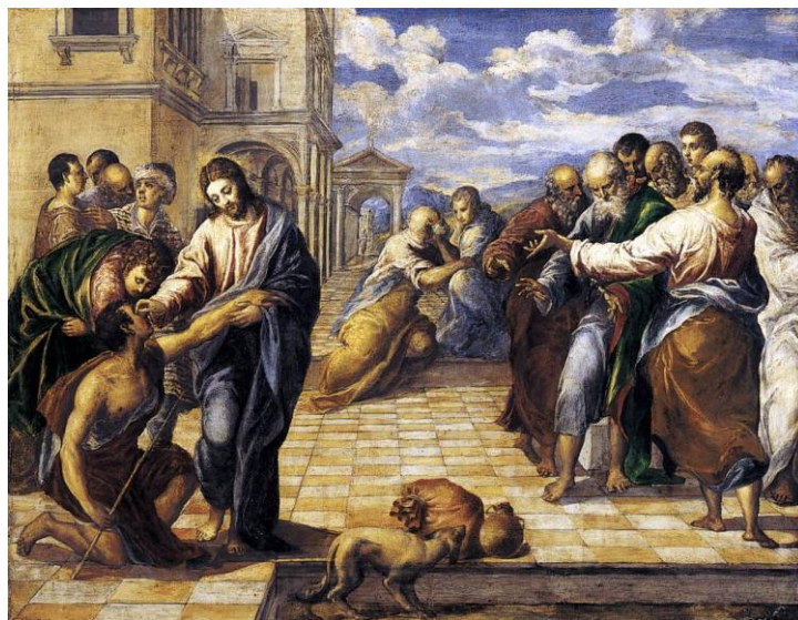
El Greco, Christ Healing the Blind , c. 1570 Gemäldegalerie Alte Meister, Staatliche Kunstsammlungen, Dresden, Germany

His development of religious narratives in the late 1560s and 1570s marks a novel entry in his artistic repertoire, and the compositional techniques of the works model elements of religious and liturgical theater, absorbed through artistic sources. The artist's concern for dramatization in these narratives is evident, from his inclusion of visual rhetoric of gestures to the integration of figures into a scenic background. Both subjects show implementation of a more daring setting than he had yet attempted, and the depictions conform to a category of history painting (or istoria ), that Leon Battista Alberti called 'a painter's most important undertaking'. As Alberti's narrative did not appear in the Italian vernacular until 1547, the text played an integral role in the development of the religious narrative much later than it was first written. Around mid-century, we see its influence on the development of ever increasingly theatrical narratives by Tintoretto and other Venetian contemporaries. Alberti's treaty still being relatively current upon El Greco's arrival in Venice in 1567 means it likely played a guiding role in the young painter's self-tutorial of Italian art. 78 He matched the standard of painterly drama set out by his Venetian, and later Roman, peers.